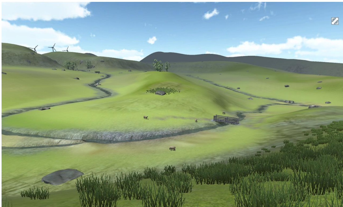
Figure 1. Screenshot from Game