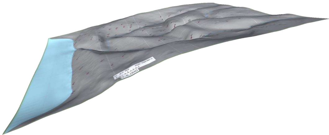
Figure 5. Terrain Mesh with draped map

To begin populating the environment with rocks and other assets, a .tif image of the Map with completed outcrops plotted was draped over the terrain as the first layer of what is called the 'Splat Mat' in Unity terminology ( figure 5 ). This first terrain texture was added and given the same dimensions as the map, in this case 1900px by 1450px, so it covered the mesh completely. Usually textures are small tileable images that are painted onto the terrain to give the impression of surface materials, like sand or grass.