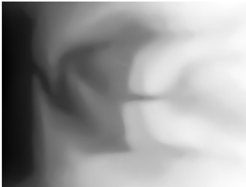
Figure 3. Heightmap

Opening the file in ImageJ ( http://imagej.nih.gov/ij/ ), an open source software, the ASCII file was exported as a 16bit .tif file ( figure 3 )