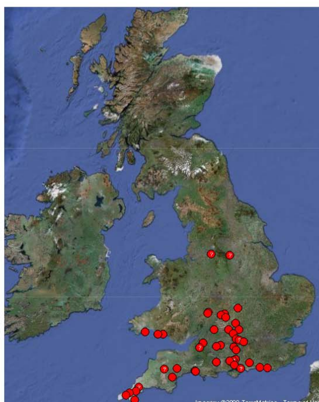
Distribution of Father Christmas and the Turkish Knight Unexpectedly localised