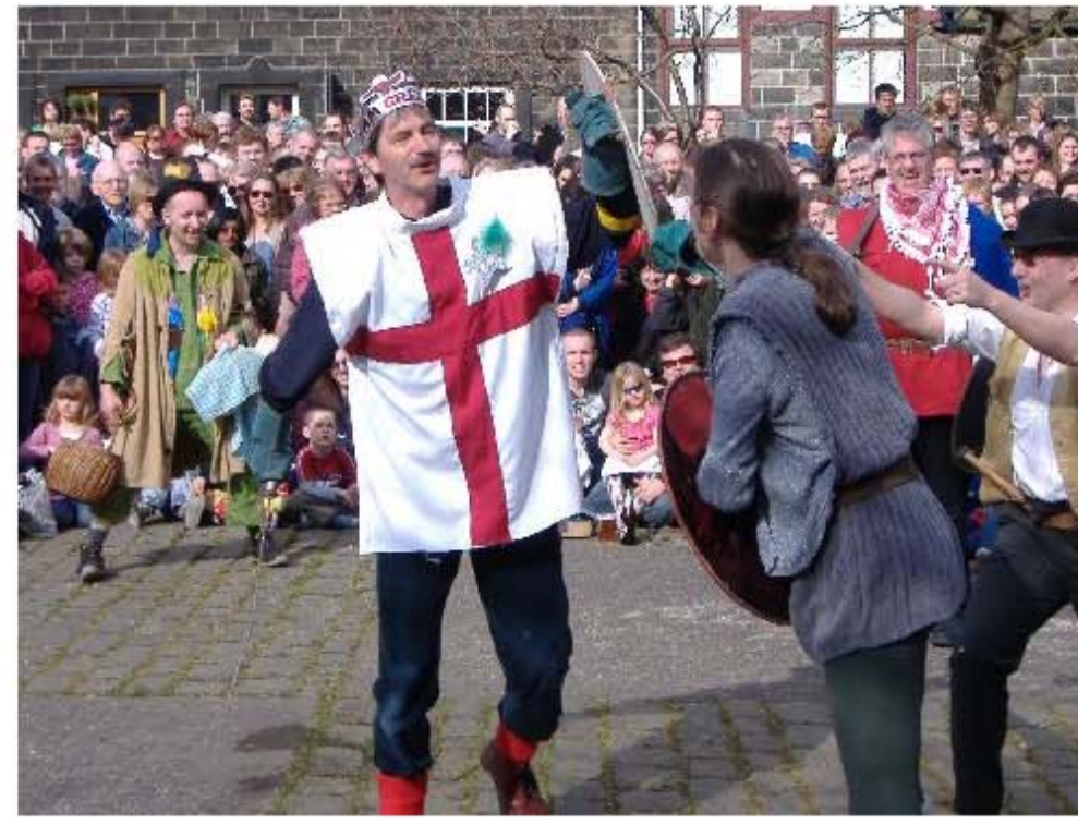
Heptonstall Pace-Eggers, Yorks., 2007 (above) Burton upon Stather PloughJags, Lincs. (below)

Mumming and guising plays are short verse folk dramas performed by ordinary people around pubs and houses at Christmas and certain other seasons throughout much of England, Scotland, parts of Ireland, and outposts in the Americas.