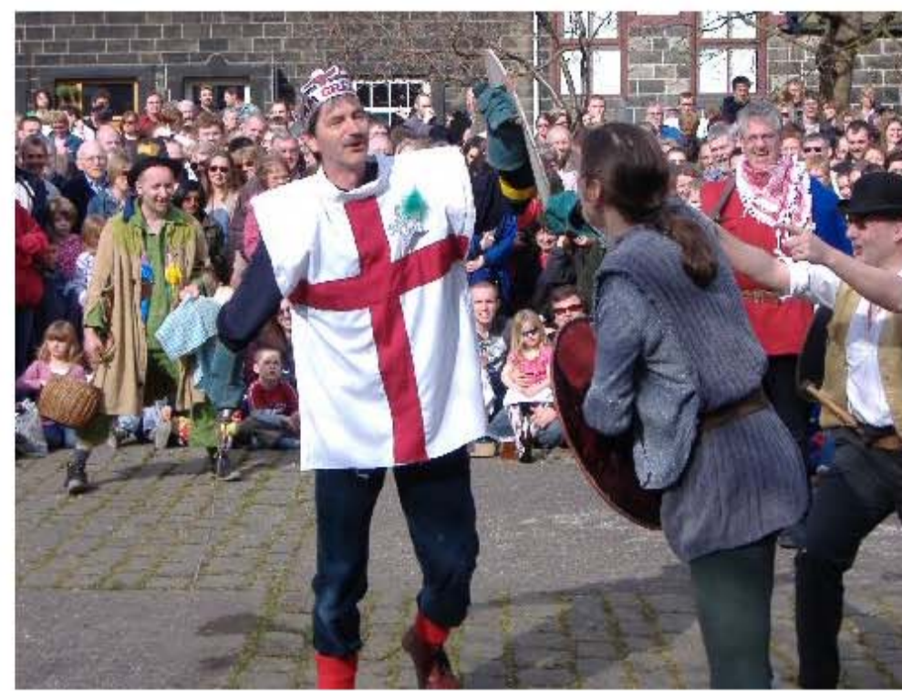
Heptonstall Pace-Eggers, Yorks., 2007 (above) Burton upon Stather PloughJags, Lincs. (below)