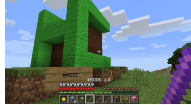
Figure 6: A compass provided by DiviningRod showing the distance (1 meter) to a player-created sign.