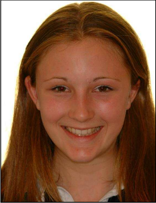
Figure 1 'Failed' headgear treatment