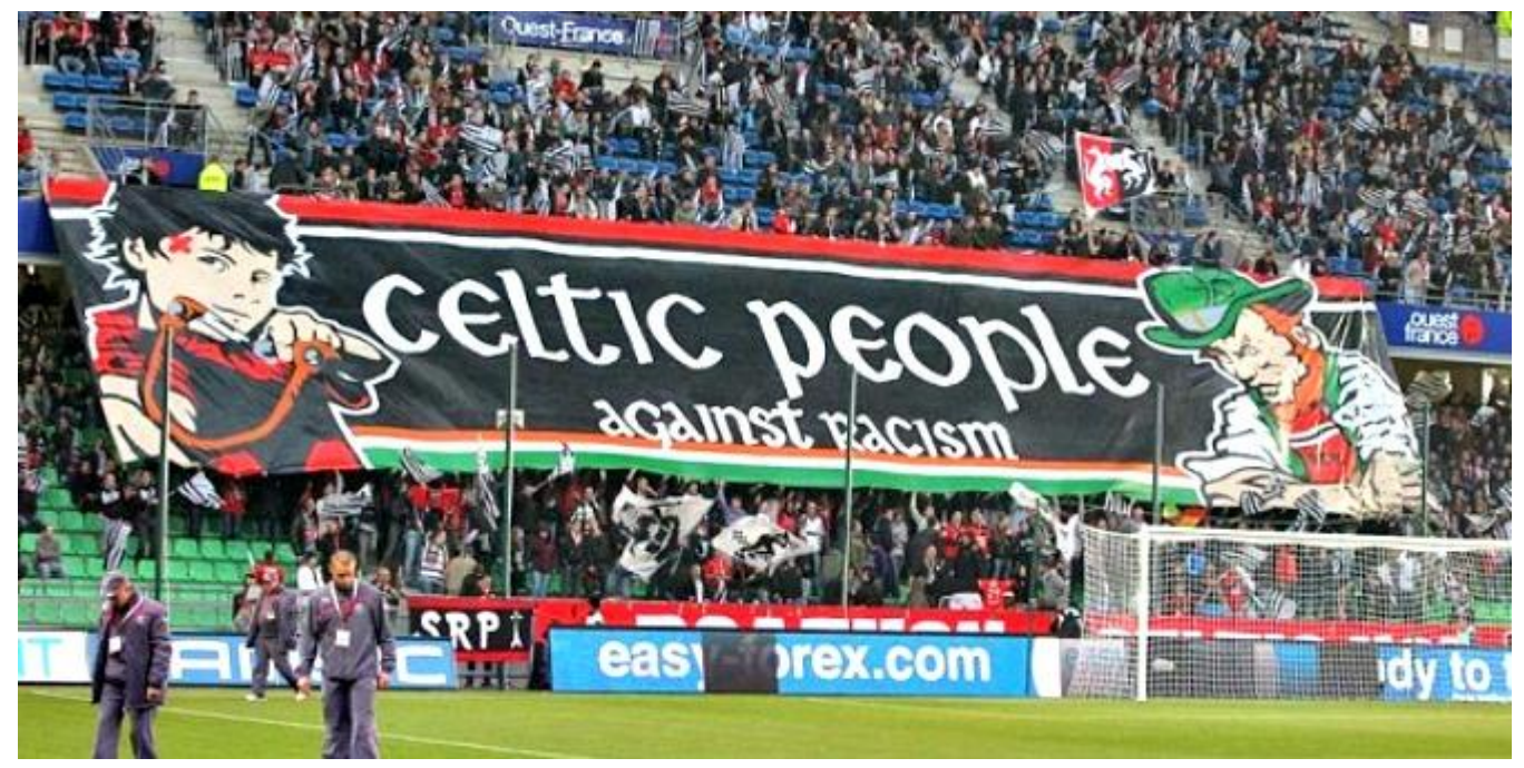
Celtic Fans erect the banner against racism in the stands during their Europa League match against Rennes in France.

'With not much excitement in your life, you latch on to a tribe who then become the focus of your life and you live and breathe it. I believe it's more to do with the poverty/boredom/mob rules, a need to release your frustration at what little seems to be going right in your life' (p.53).