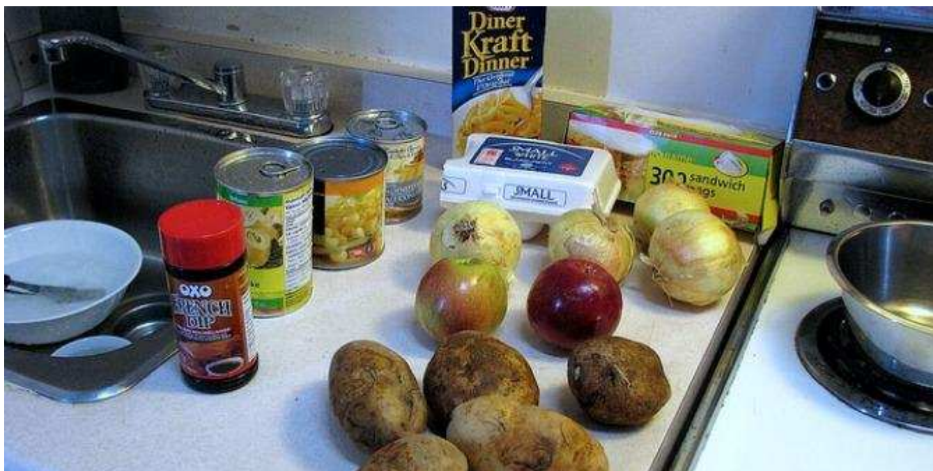
Food bank items.

'There is no recognition by the central state of the problems associated with, nor acceptance of responsibility for, the growing number of households unable to survive economically, and who are using charitable and emergency food sources' (p.169).