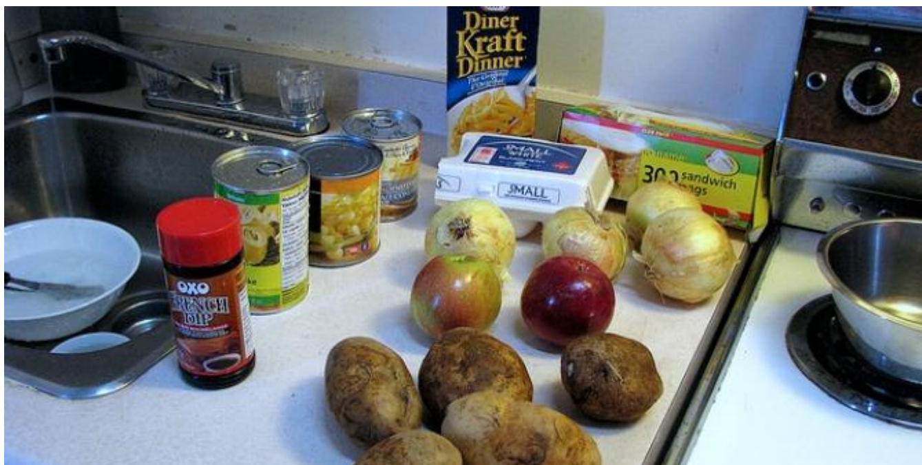
Food bank items.

'There is no recognition by the central state of the problems associated with, nor acceptance of responsibility for, the growing number of households unable to survive economically, and who are using charitable and emergency food sources' (p.169).