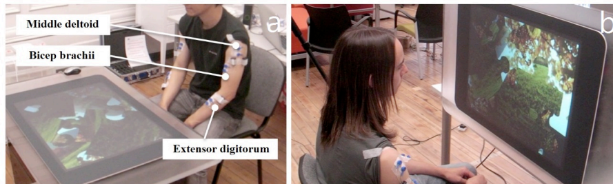
Fig. 1. The experimental set up for the horizontal (a) and vertical (b) configurations

Eighteen males, who were familiar with multi-touch technology and were free of musculoskeletal disorders, took part. The mean age was 26.4 ( \pm 4.6 ). Three were left-handed. The tabletop was raised to a height of 26" using wooden panels to allow comfort and participants sat on a chair 18" in height (Figure 1a).