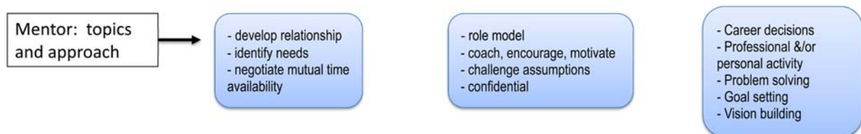
Figure 1 Models of supervision (A) and mentoring (B) showing illustrative examples of issues to be addressed from the perspective of the trainee, key roles of the supervisor or the mentor and potential outcomes.

able to be a mentor to a trainee?” and “Does a trainee need a separate mentor and supervisor?” There is value in considering desirable organisational outcomes, such as retention of trainees within specialty and within geographical areas, as this may influence the skill set required of mentors within a given programme. If we wish to move from a culture of supervisors being predominantly evaluators of quality of performance to incorporate more of the developmental role of mentors, there are inevitably going to be training implications of that decision for those undertaking the role.