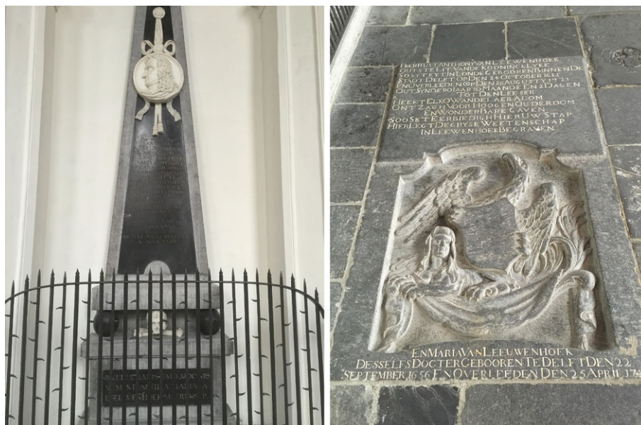
Figure 3. By chance, in the last days of finishing this review, the corresponding author was staying approximately 100 m from Leeuwenhoek's final resting place in the Oude Kerk, Delft, and captured these images.

Fluorophores only emit light for a short time before they are irreversibly photobleached, and so microscopists must limit their sample's exposure to excitation light. Photobleaching can be used to reveal kinetic information about a sample by fluorescence recovery. In the earliest fluorescence recovery study, in 1974, Peters et al. [42] bleached one-half of fluorescein-labelled human erythrocyte plasma membranes and found that no fluorescence returned, indicating no observable mean diffusive process of the membrane over the experimental time scales employed. Soon after, analytical work by Axelrod et al. [43] (on what they termed fluorescence photobleaching recovery) allowed them to characterize different modes of diffusion in intracellular membrane trafficking. The term FRAP appears to have been coined by Jacobson, Wu and Poste in 1976 [44]. With FRAP capabilities commercially available on confocal systems, it is now widely used for measuring turnover kinetics in live cells.