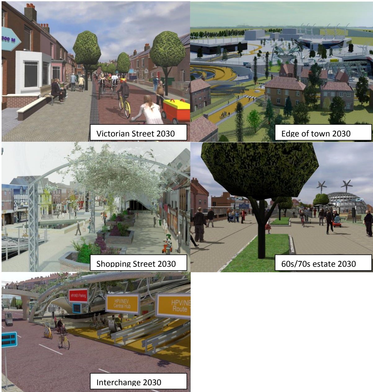
Figure 5: Five urban locations as they might appear in Vision 3 in 2030.