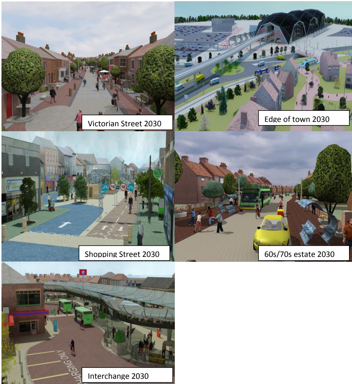
Figure 4: Five urban locations as they might appear in Vision 2 in 2030.