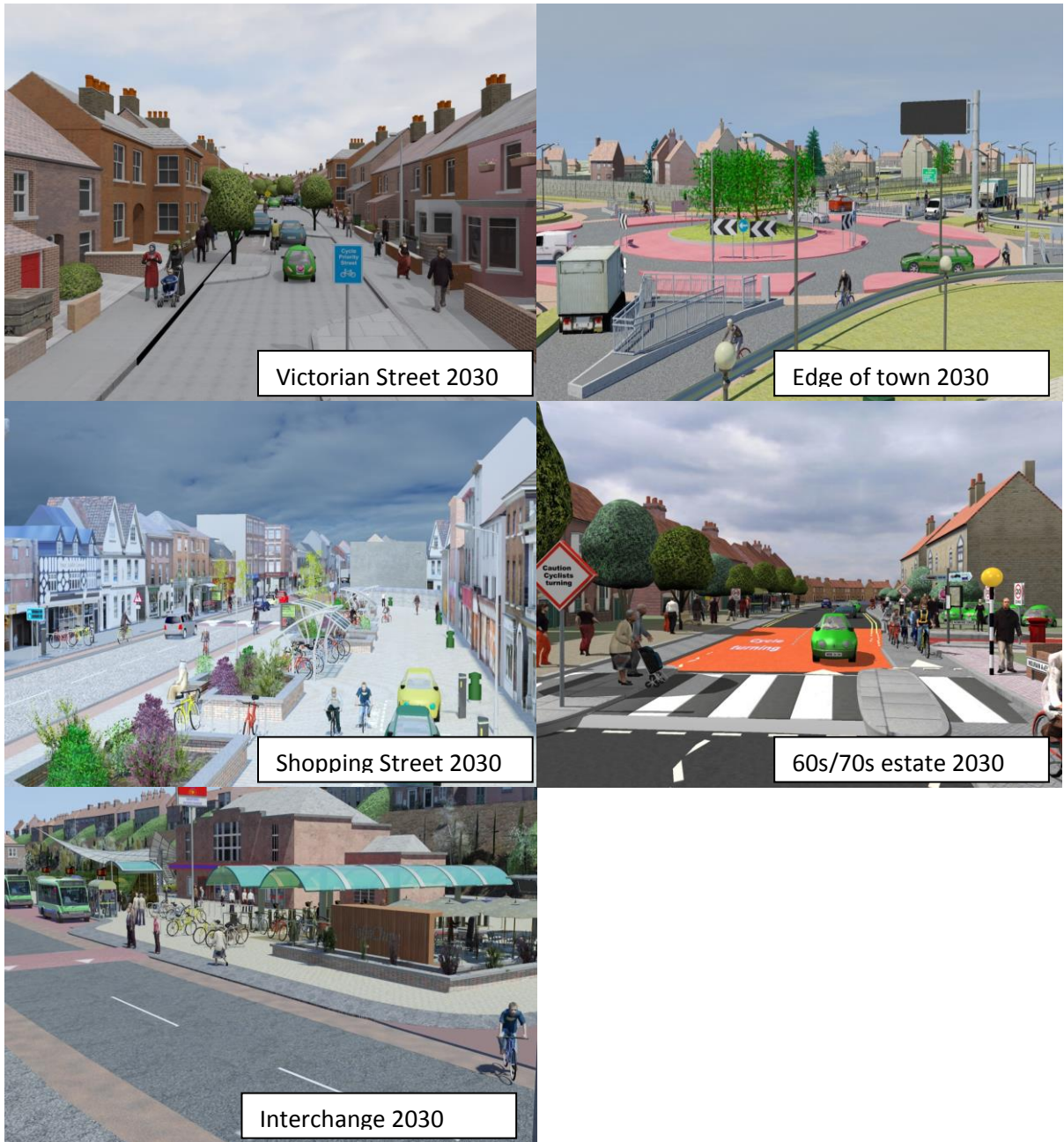
Figure 3: Five urban locations as they might appear in Vision 1 in 2030.