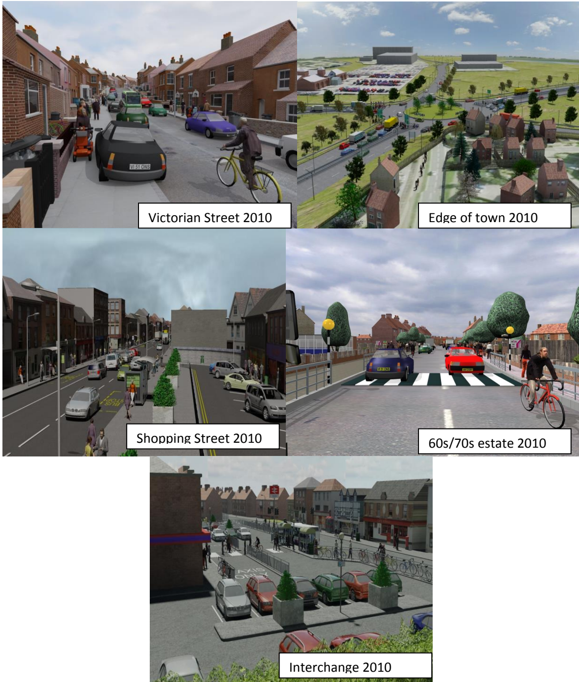
Figure 2: Five different locations in the urban area of 2010