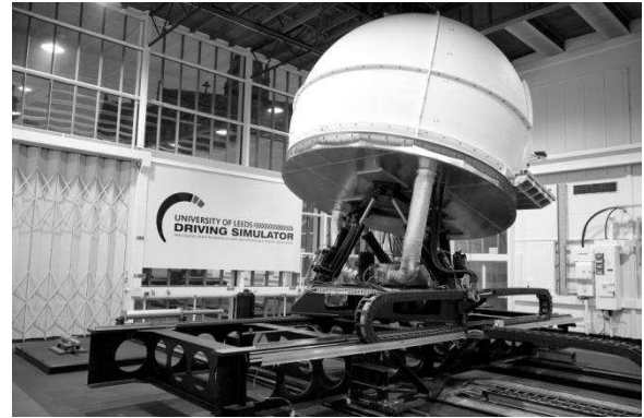
Figure 1: exterior view and vehicle cab of the University of Leeds Driving Simulator

The driving study began with a twenty minute familiarisation period with the researcher present in the car. Participants were then asked to drive the motorway in isolation (~45 minutes), whilst the researcher interacted with them from the control room, calling and texting them on their own mobile telephone. Before commencing the drive, participants were told that the researcher would contact them on their mobile telephone and that they were not obliged to respond to the call or text and should behave as they would in the real world. To maintain a similar level of engagement from participants and good control on the contents of the ‘phone conversation’, participants were asked to engage in a Twenty Questions Task (TQT) by the researcher (see Merat & Jamson, 2012). Following the TQT, participants’ willingness to generate a call was tested by a telephone call from the researcher, asking the driver to call him back. Finally, a series of text-based exchanges between the researcher and the driver were initiated. Here five short (4/5 word) sentences were sent asking participants simple questions such as: “What day is it?” Or “What is the capital of France?”