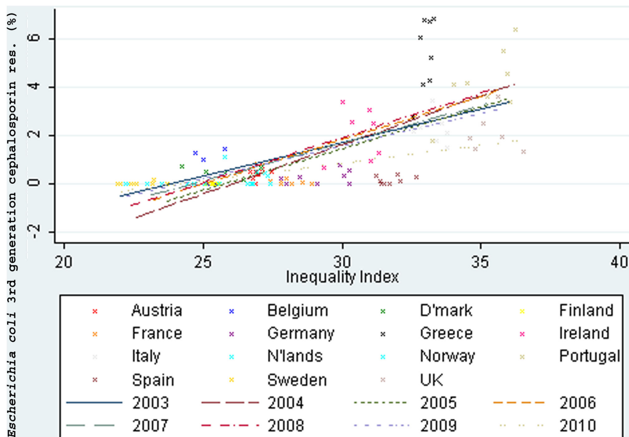
Figure 2. Income inequality correlated with third generation cephalosporin resistance in Escherichia coli (2003-10).