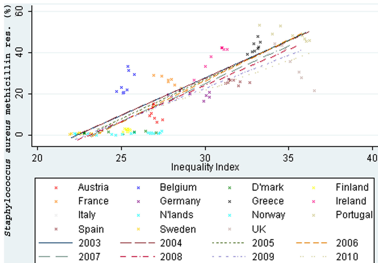
Figure 4. Income inequality correlated with methicillin resistance in Staphylococcus aureus (2003-10).