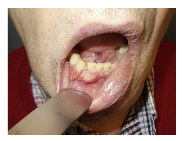
Fig. 2. Gingival Metastasis.

treatment with curative intent and initially made an uncomplicated recovery. Eight weeks after completion of treatment he attended his GMP to draw attention to a rapidly growing asymptomatic labial gingival swelling adjacent to his lower right lateral incisor (Fig. 2).