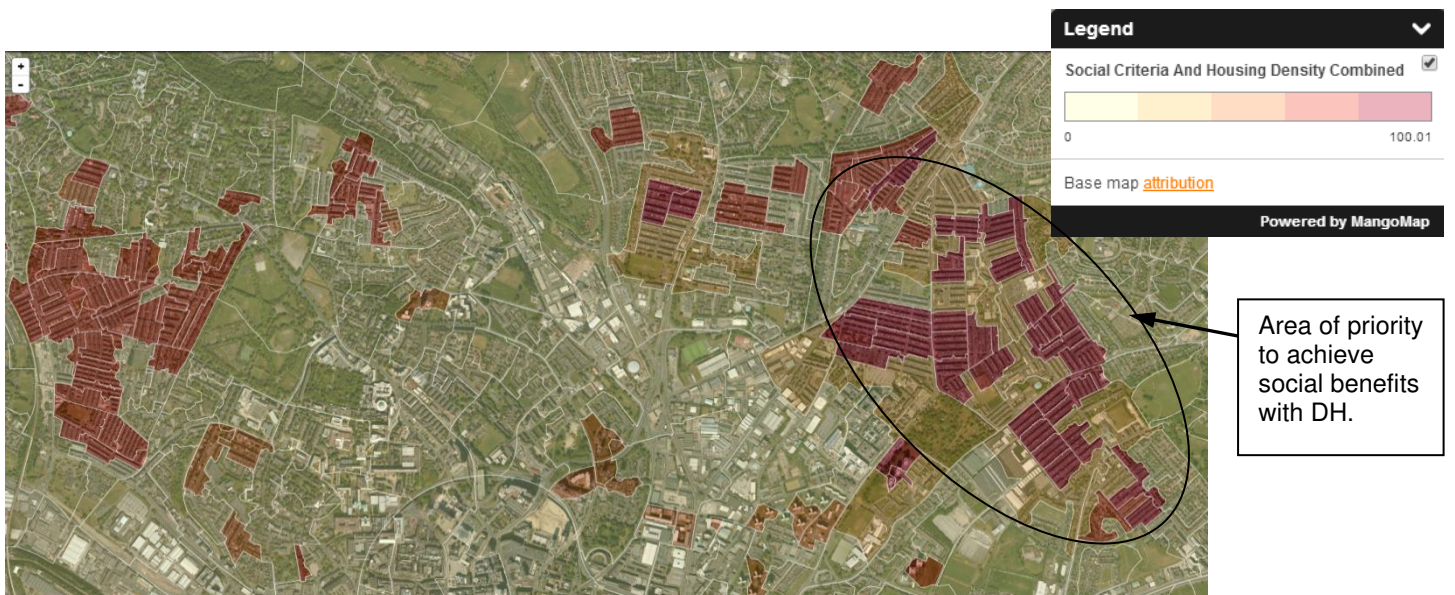
Fig. 3 Map showing census output areas scored for high housing density (60% weighting), and two social indicators (40% weighting) of fuel poverty levels and the index of multiple deprivation for Leeds, UK.