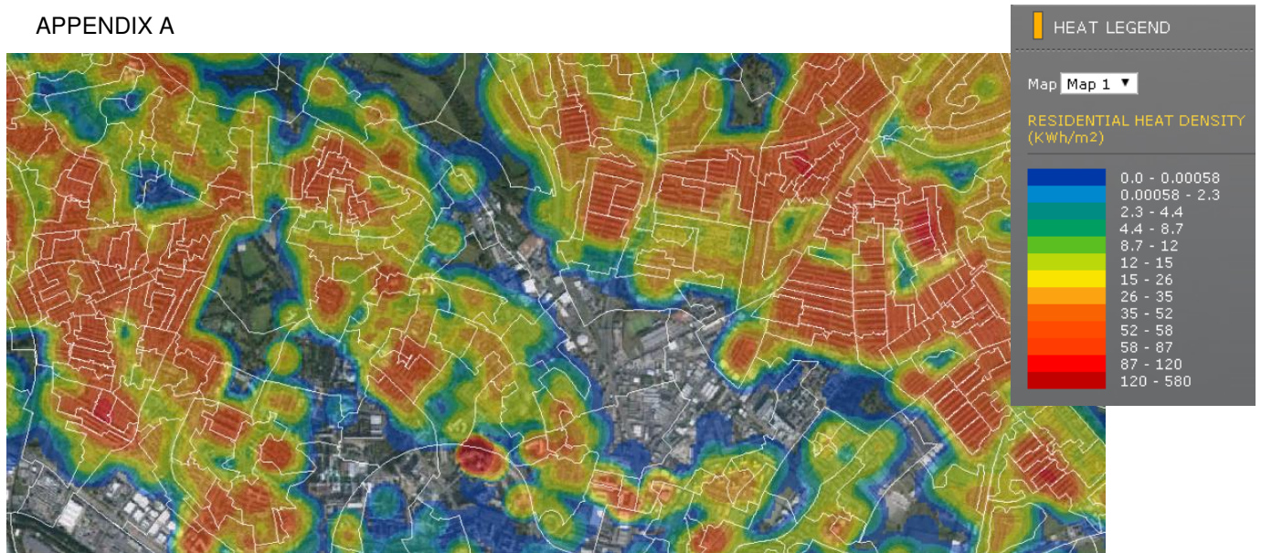
Fig. 1 Extract from the DECC National Heat Map showing modelled residential heat demand in Leeds, UK.