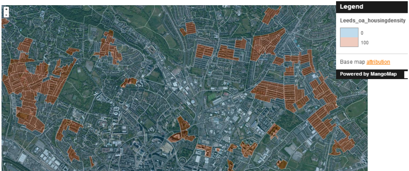
Fig. 2: Map showing census output areas with housing densities in the top ten percentile for Leeds, UK.