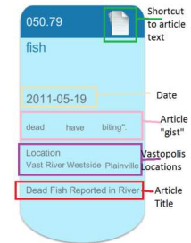
Figure 4. Index Card Fields

As shown in Figure 4, the cards also show a “gist” of the article by displaying the top three most significant keywords of the article, the article title, Vastopolis locations mentioned in the article, which are extracted and appended to the cards by the middleware based on a pre-compiled list, and the date of the article. The cluster of returned cards can be filtered by any of the card features and the cards also have a shortcut to the full text of the article.