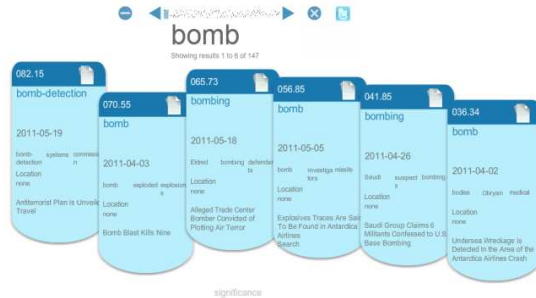
Figure 1. INVISQUE index-card visualization arranged on X-Y axis

We used the Interactive Visual Search and Query Environment (INVISQUE), a prototype visual analytics interface created at Middlesex University, to visually sift through the news corpus. INVISQUE uses index-card visualization to represent individual information items, in this case the news articles, and arranges them on screen on an X-Y axis. Figure 1 shows the search results from the keyword search “bomb” arranged on the X axis by significance and on the Y axis by date - so that news articles with higher level of significance for the keyword “bomb” appears more to the left and newer articles appear higher up the Y axis.