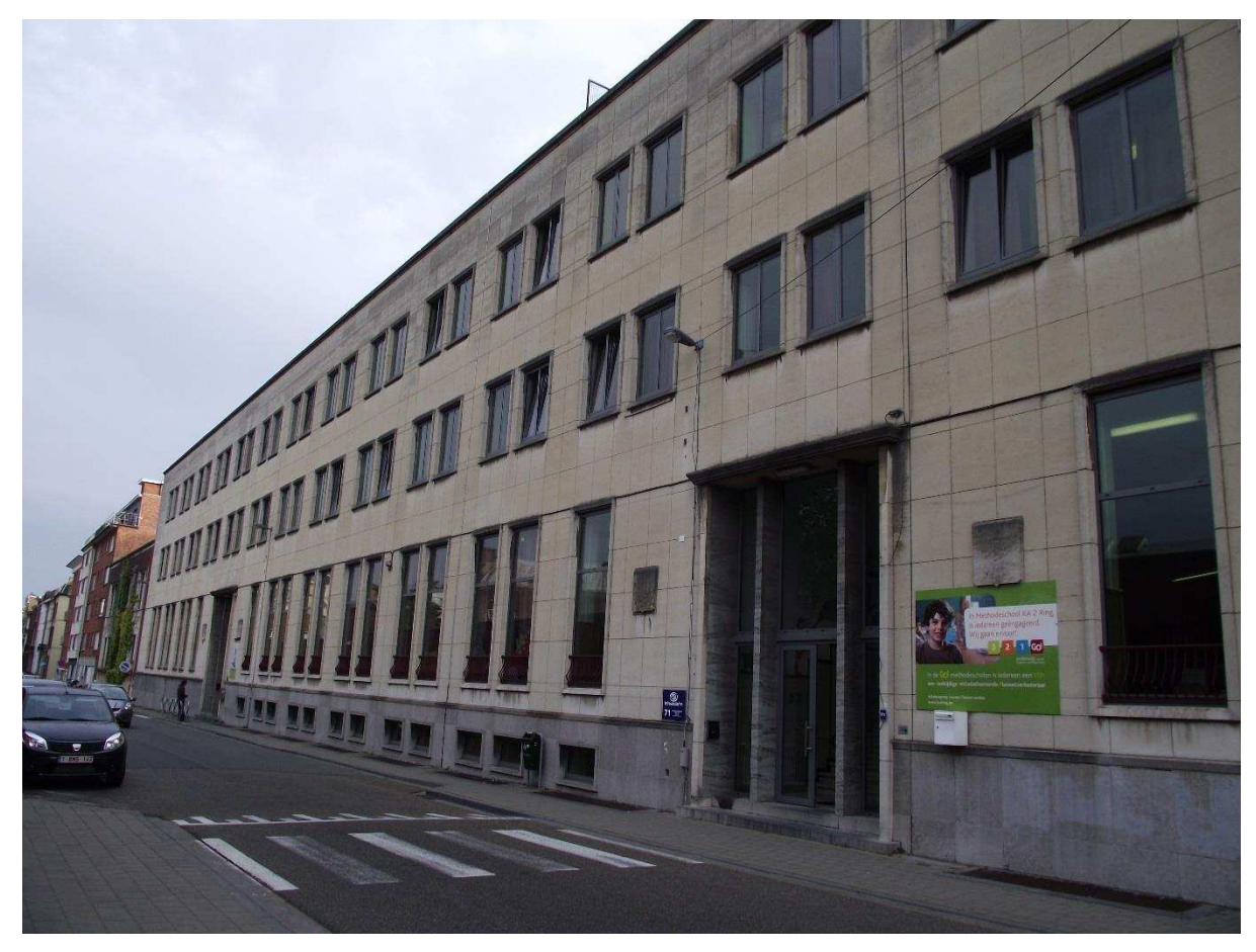
The importance of the agency building