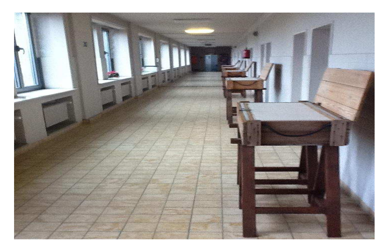
Figure 3: Corridor in Flemish agency

Visitors arriving at the agency will also see this corridor (Figure 3) which leads to the professionals' offices. These are situated on the right hand side and each has a caricature of the person whose office it is on the door (see for example Figure 4). There are, in between each office, what appears to be miniature coffins on stilts yet these wooden boxes are actually symbolic gestures which have been situated in this corridor to specifically welcome and reassure new visitors. When this agency moved from using paper files to using the computer, they asked a local artist to compress all the case files into these handmade boxes.