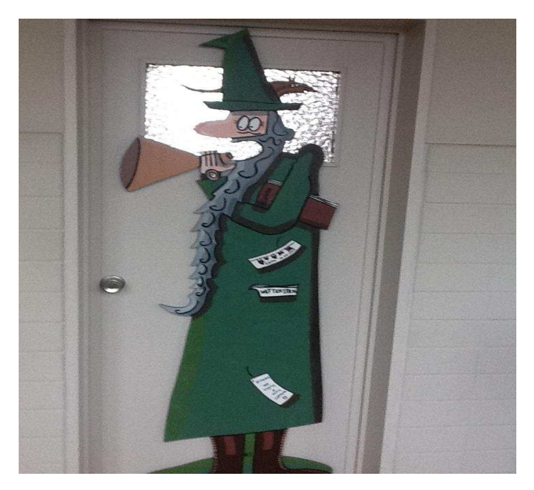
Figure 4: Caricature on door of practitioner's office

alone, for as they can see, there have been countless families who have come before them and who, like them, have struggled with certain issues in their lives.