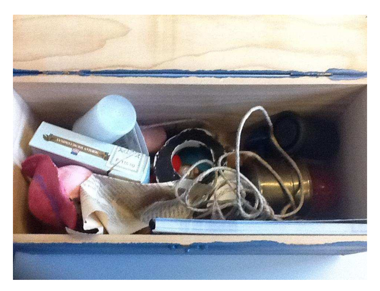
Figure 7: Little box of things, Flanders.

In terms of the materials that were used by social workers when working with children and parents within these spaces, there were a number of similarities and differences. Both countries were adept at using puppets to encourage conversations to develop when working with children. However, in Flanders other creative methods were also used such as this box of unusual items (see Figure 7). These bits and pieces were used as another symbolic gesture, another more intimate way of making a connection with a family, be that a parent or child, in order to reassure them, once again, that they were not alone.