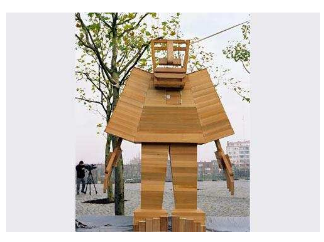
Figure 8: Golem*, Flanders

This is enhanced even more so with symbols such as Golem (see Figure 8). When the Director of the Flemish agency first came across Golem he knew that he had found a link between the agency and those children who found it difficult to open up and share the traumatic experiences they had encountered, a response he calls "freezing". Golem represents the frozen child because he too is unable to talk about that which he has experienced and subsequently appears unaffected and impassive too. However, just like the children Golem also has a heart which in this picture is symbolised by the hatch in his chest and it is this, when opened, which leads to his inner world.