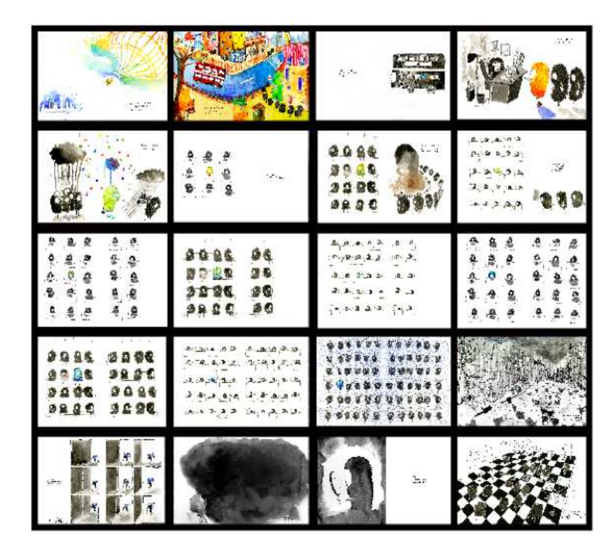
Figure 2: Example pages of applying colour to express emotions in the illustration work.