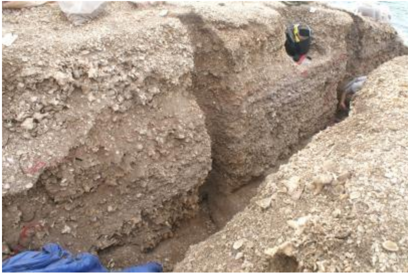
Figure 9. General view of west-facing section of Janaba 4 after removal of column samples, looking towards the South. Note the layer dominated by large gastropods ( Pleuroploca sp., Chicoreus sp.) at the top left of the section and thickening towards the left of the image. Photo by Geoff Bailey, 21 November 2012.