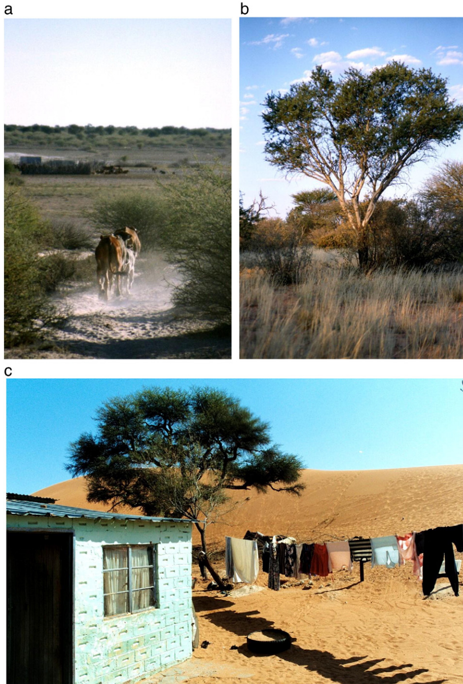
Fig. 2. Typical images from the Kalahari of a) cattle making their way through Acacia mellifera thorn bushes to a cattle post and borehole to access drinking water; b) dune encroachment; and c) Shepherd's tree ( Boscia albitrunca ) in SW Kgalagadi District, Botswana.

different form to the social–ecological system that preceded it. Crucially, in the context of this paper, if this process of re-organisation was triggered by climate change, the new system should be well adapted to the new climatic regime, though it will likely be vulnerable to some other future perturbation, which may lead to the adaptive cycle repeating once more.