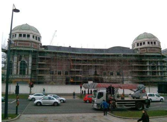
Figure 2.2: The former Odeon cinema

The dereliction and inactivity surrounding the former Odeon cinema building which runs along the western edge of City Park was commented upon by several people (see Figure 2.2).