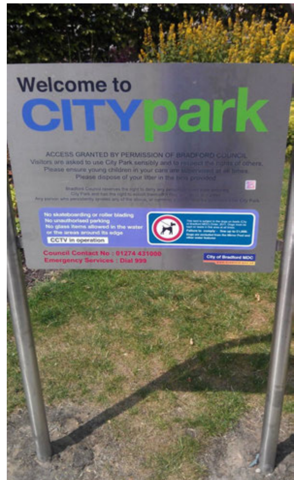
Figure 4.1 City Park's rules and regulations

The main rule that has been introduced relates to the use of glass items in and around the Mirror Pool given the danger this presents to children playing in the water. Dogs are to be kept on leads at all times and are not permitted in the Mirror Pool. Young children are expected to be supervised at all times by their guardian mainly due to the risk presented by the water. More broadly, the public notices warn visitors that 'disruptive' behaviour (undefined apart from the specific restrictions listed) may lead to those responsible being escorted off the premises and, where behaviour persistently flouts the park's restrictions, people risk being excluded from the space.