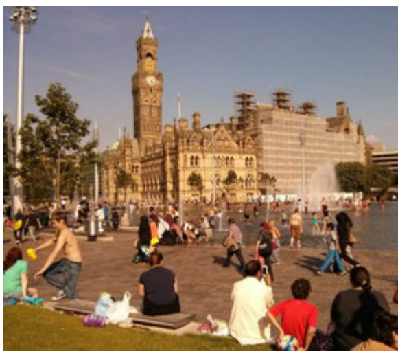
Figure 3.2: City Park on a warm summer's day, 2013

Beyond concerns about how the Mirror Pool is used, a local business employee thought standards of behaviour in general were too lax: 'You could walk around in your underwear and I don't think anybody would say anything to you.' This person also thought there were cultural differences between white and Asian notions of acceptable behaviour: