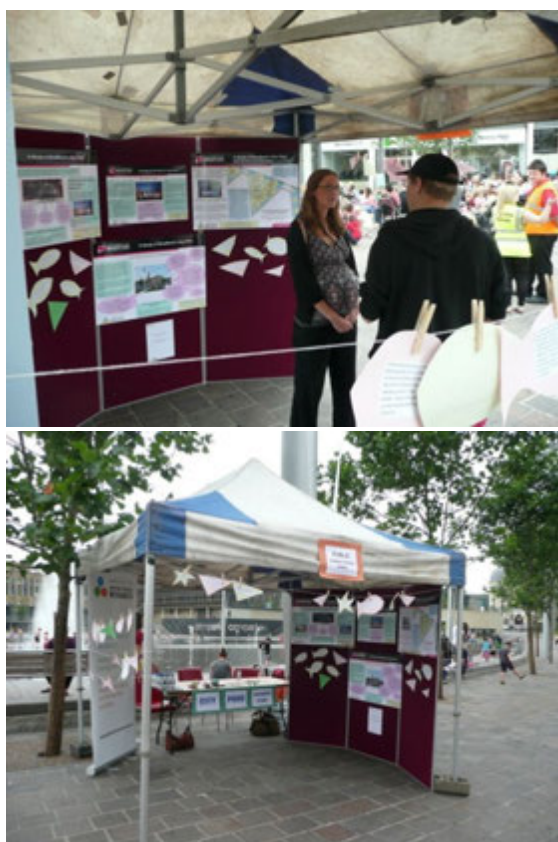
Figure 1.2 Public consultation event

people's comments, chat with the research team and make comments of their own.