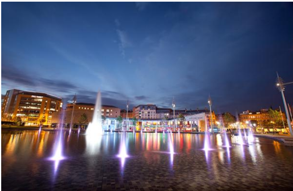
Figure 2.1 City Park at night (Bradford MDC)

The dereliction and inactivity surrounding the former Odeon cinema building which runs along the western edge of City Park was commented upon by several people (see Figure 2.2).