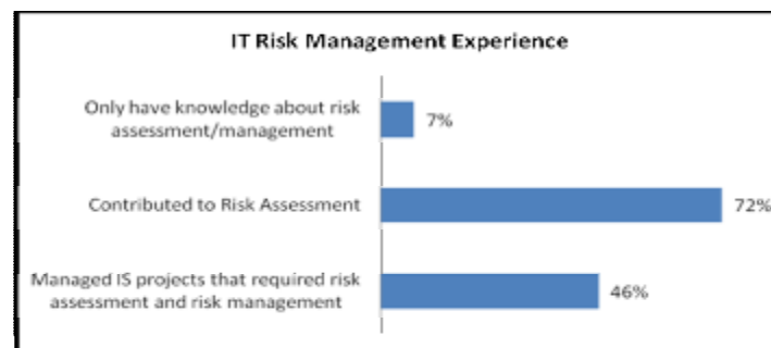
Figure 3. IT risk management experience of respondents

In the bar chart shown in the left side of the figure, it is clearly indicated that the vast majority (37 = 95%) of the respondents have more than 4 years of IT industrial experience. A significant percentage (38.5%) of them also have practical experience in cloud computing. Moreover, the pie chart shown in the right side of the figure indicates that respondents, who do not currently have practical cloud experience, still have good knowledge about cloud computing (41%) or at least understand the basic concepts of this advanced IT model (21%). Apart from general IT and cloud knowledge, Figure 3 below shows that 72% of the respondents also have previous experience in IS risk assessment, and 46% of them even have experience in managing IT projects that involved risk assessment and management practices. Overall, this demographic information proves that respondents of the survey have the necessary IT knowledge and experience to give valuable insights to the cloud risks studied.