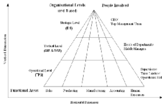
FIGURE 1. DIVISION OF ORGANISATIONAL LEVELS AND FUNCTIONAL AREAS (MODIFIED FROM FIGURE 2.1 IN LAUDON AND LAUDON [6])

tactical level (deals with medium-term planning and controlling on budgets and resources), and strategic level (involves long-term strategic planning) [6]. Moreover, and in the horizontal dimension, a company also consists of a number of functional areas, such as sales, manufacturing, purchasing, finance, and human resources areas (Figure 1).