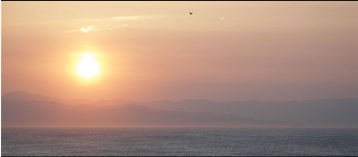
Photo: The view over the Japan Sea towards Sado Island at sunset. Taken by the author from the campus of Niigata University in November 2004.