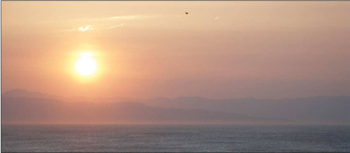
Photo: The view over the Japan Sea towards Sado Island at sunset. Taken by the author from the campus of Niigata University in November 2004.