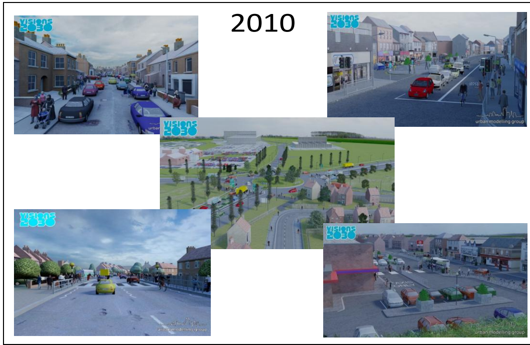
Figure 1: Street scenes in 2010

(2) The second step has been to create vision narratives which describe various aspects of society and its transport system that are consistent with the visualisations. An overview of these visions narratives is given in Table 1.