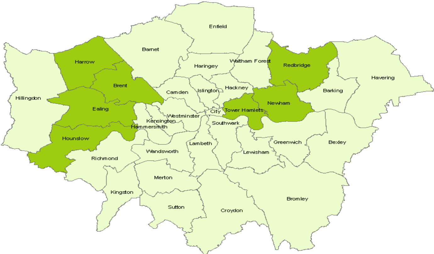
Figure 1: Map of London Boroughs

Notes: Darker shading for Asian treated boroughs applied.