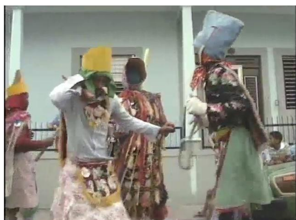
Fig.22 – Dancing resumes

After the lines spoken by Primo, the dancing resumes (Fig.22) and it is probable that the rest of the play including the action previously described (Figs.14, 20, 21 and 23 below) would have unfolded in between these musical interludes (in accordance with the Roberts recording).