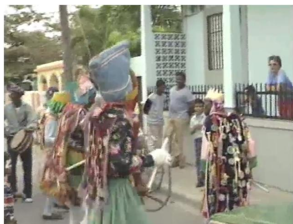
Fig.16 – Lining up in front of a house

“Mummies is a game that has a cast of a Giant, a Doctor and a King. It so happens that the Giant kills a citizen who is walking on a bridge... And the King finds the dead citizen... And he wants the Giant, as an order to bring to life the dead... In the middle of this, a Doctor, in a horse, appears... And the Doctor gives a medication to the dead that is already dead... And bring him to life! And they fight clubbing each other... And the King kills the Giant... In between dances, they do different choreography... It is very beautiful!”