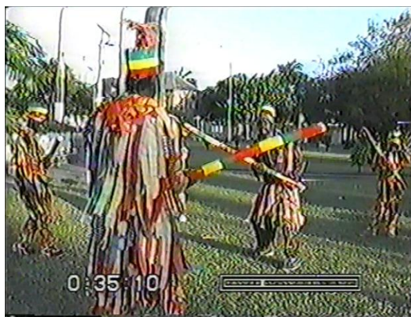
Fig.12 – King of Egypt disputes with St.George