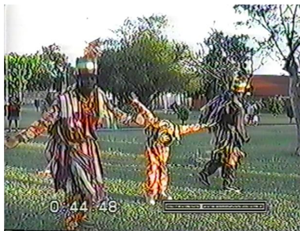
Fig.13 – The end

St. George once again boasts of his prowess as the “chief of all these valiant knights”, and is challenged by Slasher/King of Egypt, who has now become Salabim [sic] – a giant. As before, a whistle terminates their dispute, and more combative dancing takes place. This time there are also solo and three person figures, and much more stick clashing. At one point, they all drop their staves to form a line, and then led by St. George they dance around the performing area. Then there is another set of figures dancing in pairs. Towards the end, all the actors except St. George form a line, initially holding hands, and dance towards him a couple of times. Finally, they all line up holding hands, dance toward the camera and bow extravagantly. It takes two blasts of the whistle before everything ceases.