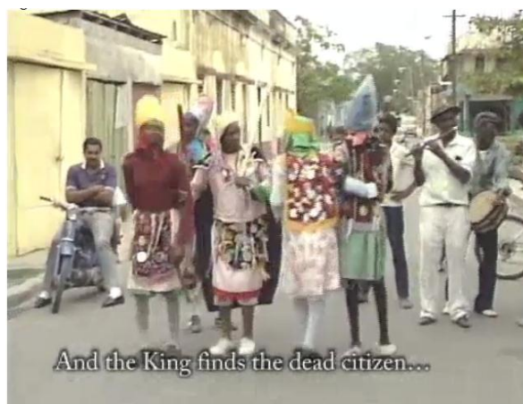
Fig.21 – Female characters (1 & 3 from left)

After the lines spoken by Primo, the dancing resumes (Fig.22) and it is probable that the rest of the play including the action previously described (Figs.14, 20, 21 and 23 below) would have unfolded in between these musical interludes (in accordance with the Roberts recording).