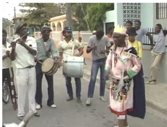
Fig.17 – The band