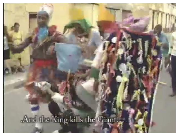
Fig.23 – The Giant killed

The costumes are richly decorated with mirrors and beads. It was remembered with pride by older members of the Cocolo community that they were able to create more impressive costumes with their greater resources in the Dominican Republic than was possible in their islands of origin.