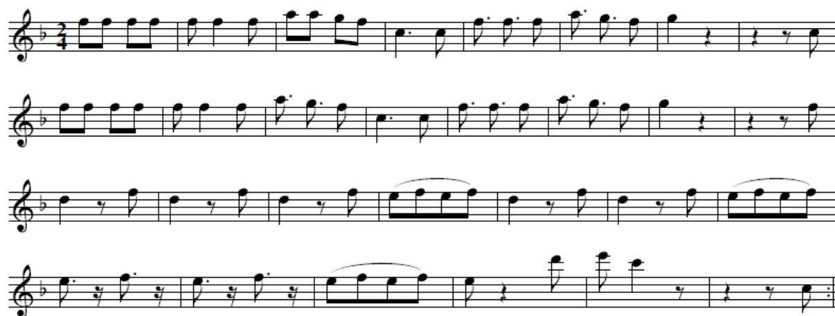
Fig.5 – Sample of phrases played by the Mummies' fife player. This is only a rough transcription, as befits the extemporary nature of the music.

The actor dancers enter in procession along a path, taking a turn towards the camera before moving onto the grass to perform. The procession is headed by three musicians walking abreast as they play. They are dressed in everyday clothes and they play a fife, a snare drum and a bass drum. The bass drum strikes a steady beat, while the snare drummer maintains a continuous syncopated drum roll. The fife music consists of repetitive phrases drawn from a core of several different melodies, although these are freely varied with grace notes and other extemporisations (e.g. Fig.5).