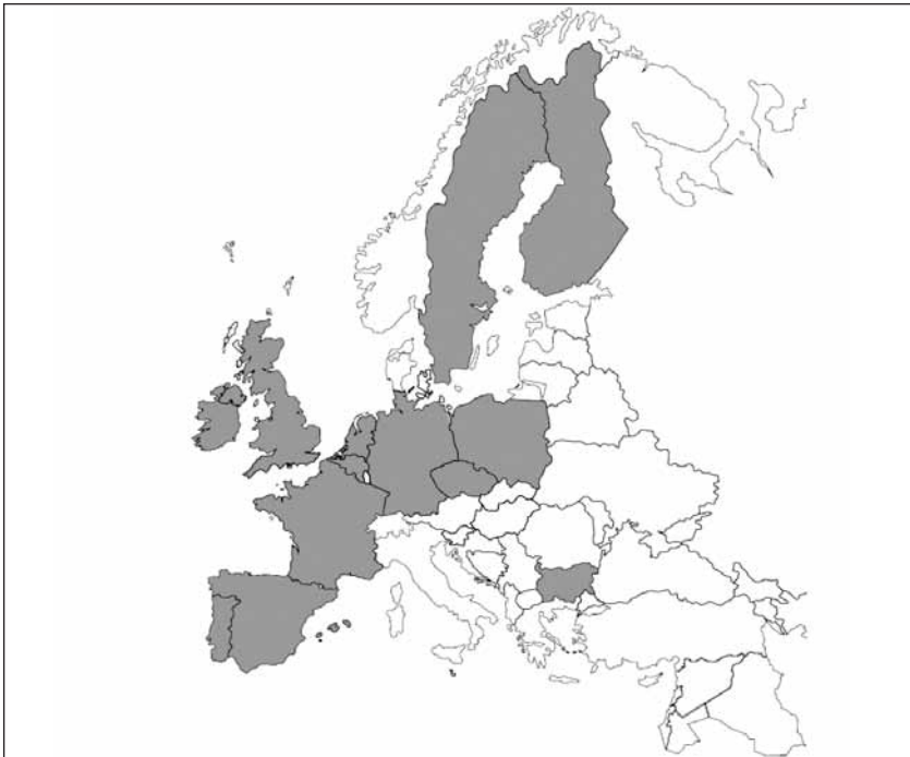
Map 3.1: The responding countries

A questionnaire was distributed to social housing experts in Belgium (Flanders), Bulgaria, the Czech Republic, Finland, France, Germany, Ireland, Netherlands, Poland, Portugal, Sweden, Spain and the UK (Map 3.1). Most of the experts were able to answer the questionnaire in English, but translation of the questionnaire and responses was undertaken where necessary. A list of the responding experts is presented in Appendix 1 .