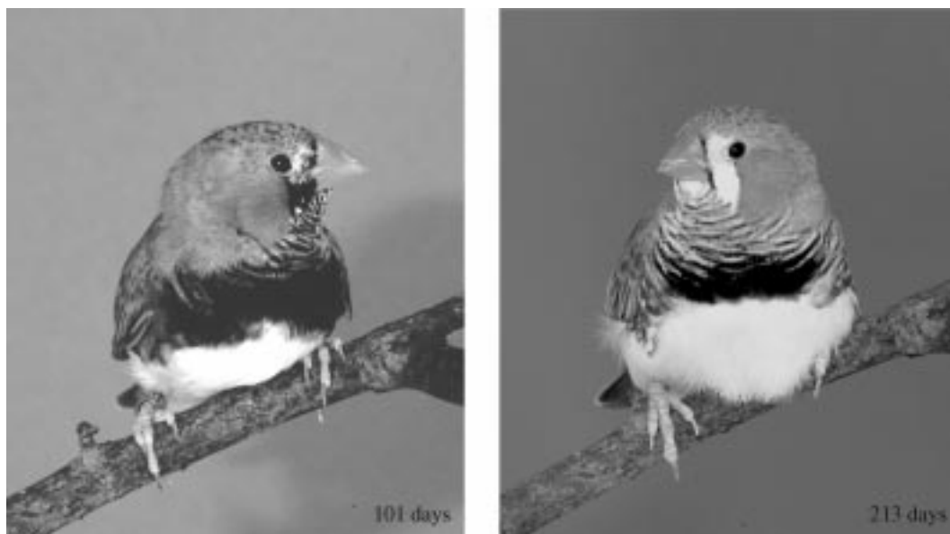
Figure 2. An example of a male zebra finch reared on a seed-only diet at 101 days of age showing abnormal areas of melanistic plumage (left) and the same individual after its second complete body moult aged 213 days (right).