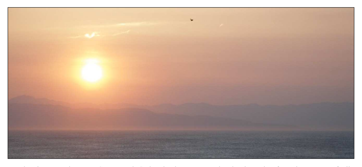
Photo : The view over the Japan Sea towards Sado Island at sunset. Taken by the author from the campus of Niigata University in November 2004.