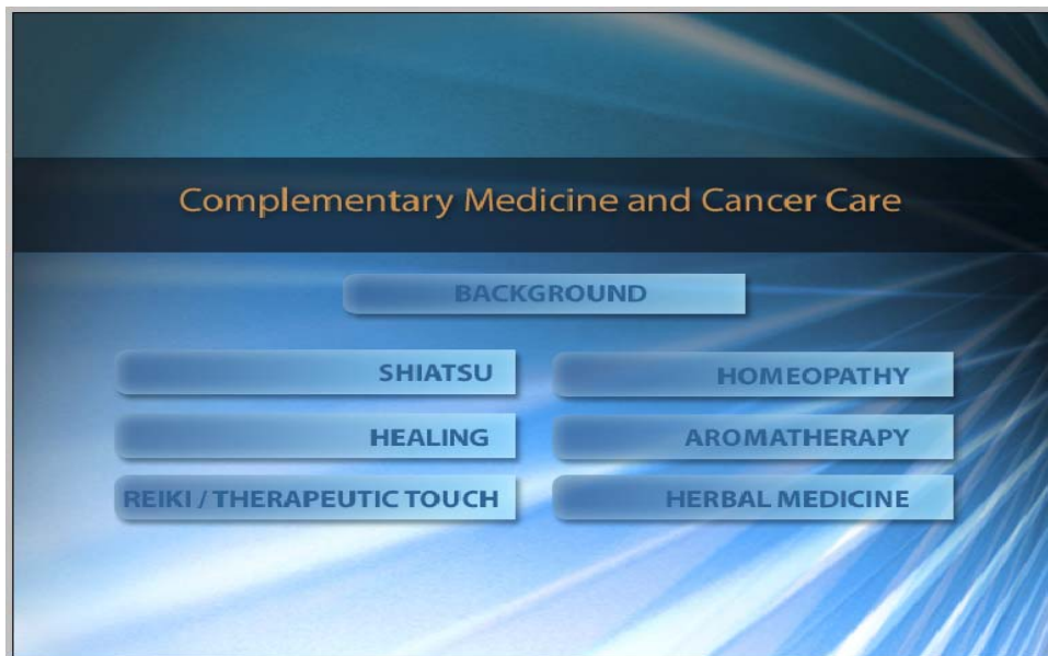
Figure 1: 'Menu' screen of the DVD

If one of these options was not selected, after a minute or so the introductory / background section would play (approximately 5minutes). The DVD would then reset to the main menu.