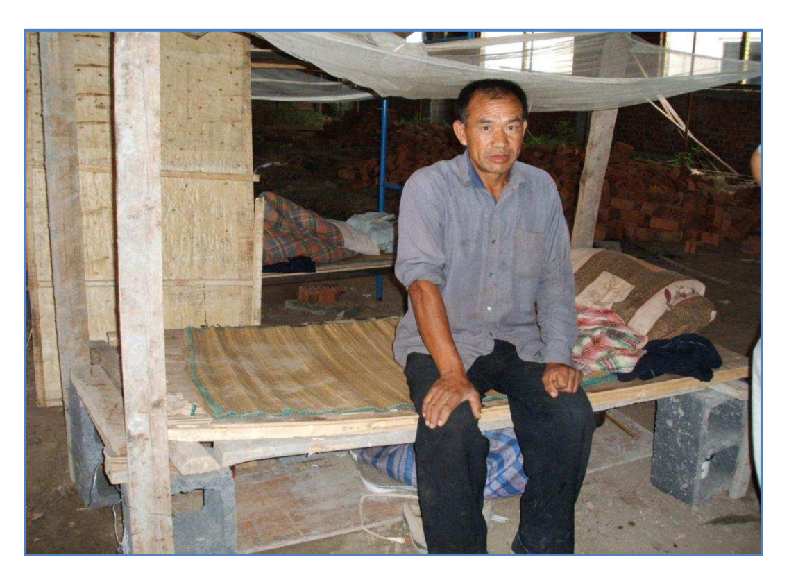
Image 1: An Older Migrant Construction Worker in Tianjin (September 2005)

migrants being employed in the public sector on a temporary basis, such as in universities, hospitals, SOEs or other governmental organizations. Differentiations in policy implementation with regard to migrants' social protection in the public and private sectors will be examined later.