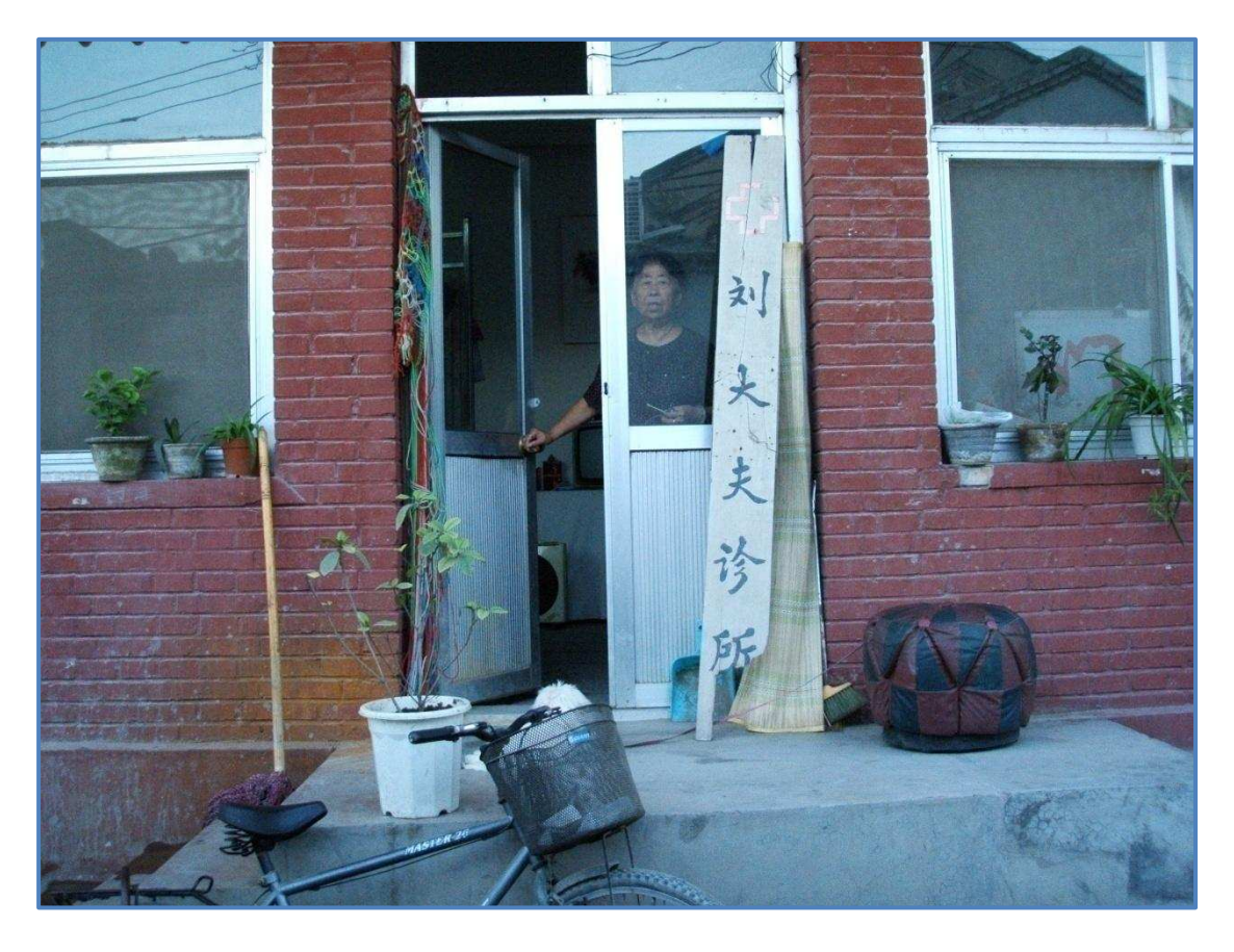
Image 4: A 'Black Medical Clinic' (hei zhensuo) Run in a Migrant Residential Community in Suburban Beijing (August 2005)

In short, despite higher geographical mobility and frequent job change, the occupational mobility of migrants, as observed in my fieldwork and consistent with the findings of other research (cf. Li, 2004), is found to be largely horizontal rather than upward movement in respect of the socio-economic status, esteem and remuneration associated with their jobs: they are likely to be employed in the low-wage, non-skilled sector of the informal economy although some longer-term migrants and suburban commuters tend to hold jobs at the lower end of the skilled sector. There has also been a noticeable increase in the number of older or married migrants living with their partners or families in the city. In addition, rural-urban migration has started showing shared features with those observed in other developing countries and regions, including for example Latin America, where migrants are frequently found working and living at the edge of large metropolises, establishing their informal institutions, such as schools and medical clinics, and developing their communities separate from the mainstream urban residential areas (see Image 4).