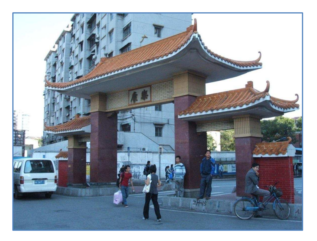
Image 3: An 'Urban Village' in Guangdong Inhabited Mostly by Migrants (November 2008)