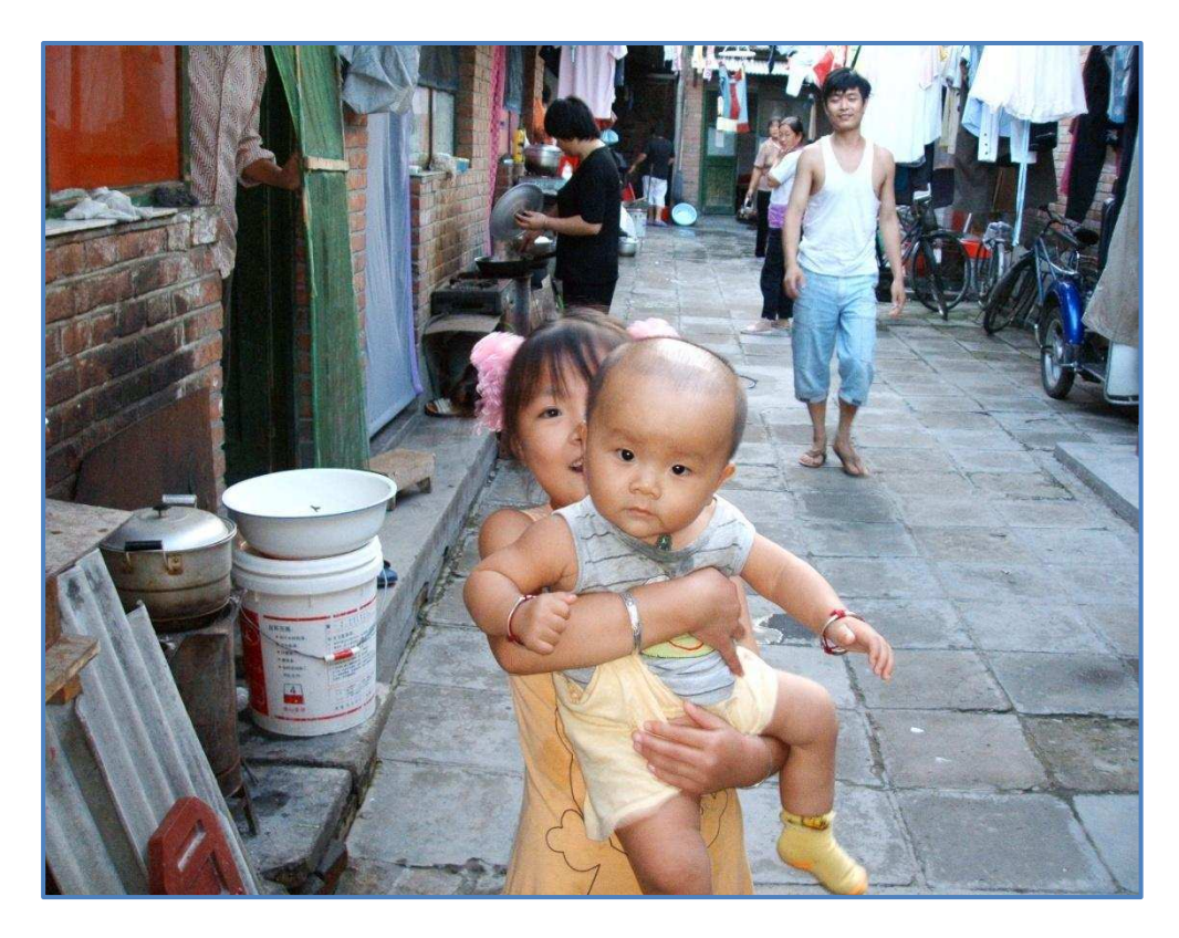
Image 2: Migrant Families and Community in Eastern Suburban Beijing (August 2005)