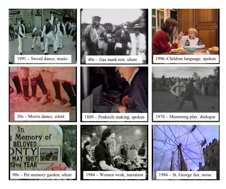
Figure 1. Examples of the material in the NATCECT collection: the date of recording, the topic, and the type of audio are indicated.

There are approximately 230 videos stored on different media (VHS tapes, Umatic tapes, and high density tape reels), most have been recorded by amateurs and donated to the Centre, examples are in Figure 1. Videos have been classified respect to their generic content and using a specific organization; for example "childlore" includes children games – skipping or clapping hands; "custom fixed date" lists traditions related, for example, to the 25th of December, Christmas, while "custom movable date" is used for traditions not linked to a fixed date like Shrove Tuesday. For the broad categories, e.g. dance, sub-categories are used, e.g. coconut, morris, sward.