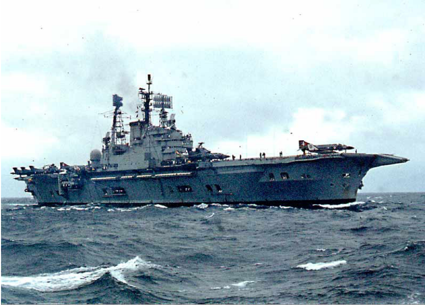
Figure 1.3: HMS Ark Royal in the late 1970s. 1976.

Where the entity of HMS Hero offered a hybridised representation of the contemporary Navy, in which fictional characters constituted the focuses of audience identification and ideological articulation, HMS Ark Royal (Figure 1.3) acquired a character of equal or even predominant importance in comparison to the documented crew (whose everyman status was encapsulated by the specific but anonymous identity of the series title).