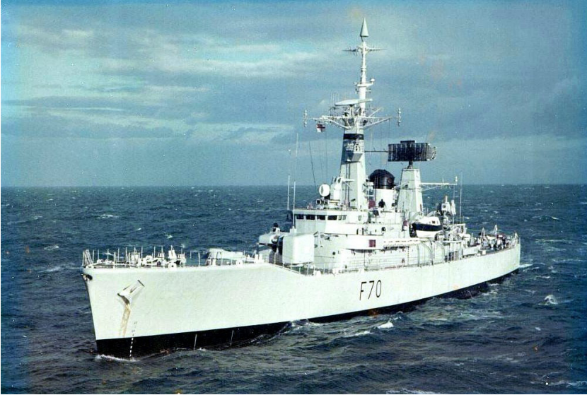
Figure 1.1: Leander -class general-purpose frigate of the 1970s. 1976. HMS Apollo , CC BY-SA 3.0, via Wikimedia Commons: https://commons.wikimedia.org/wiki/File:HMS_Apollo_1976_SMB-2008.jpg