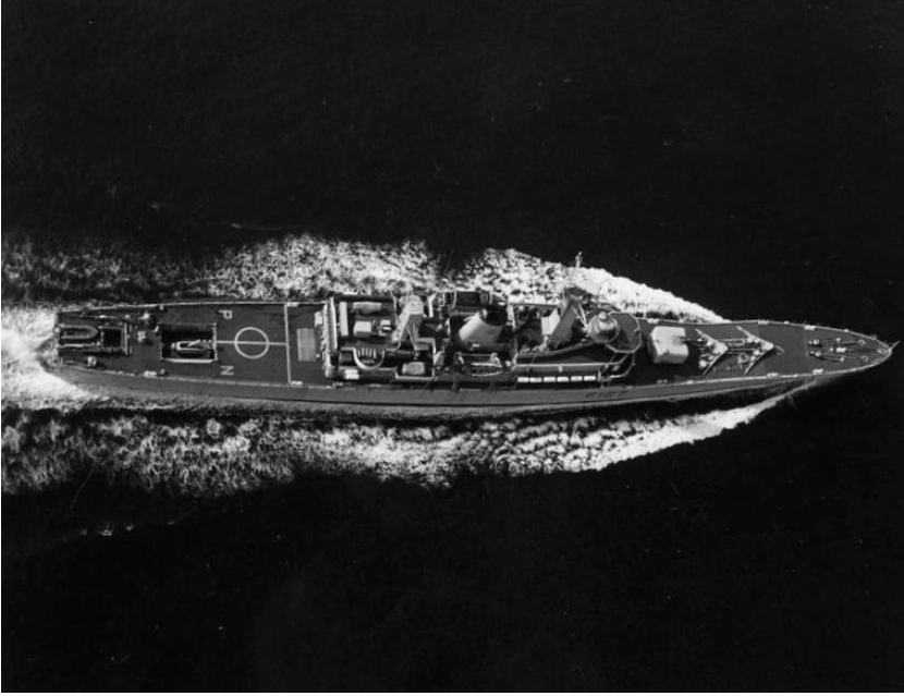
Figure 1.2: Leander -class frigate HMS Penelope . 1970.

series Ian MacKintosh, himself at the time a serving naval officer. 35 Following his appointment to the Ministry of Defence's Directorate of Public Relations (Navy), MacKintosh mooted the idea for a television series designed to project 'an upbeat and contemporary image of the RN'. 36 Subsequently MacKintosh himself wrote four episodes for the first two series. In depicting the day-to-day operations of a warship, the series incorporated many varied activities and locations, including Malta, Gibraltar and Norway, as well as familiar UK naval bases such as Portsmouth and Devonport. Despite a perceived over-emphasis upon the characters of the ship's successive commanders and officers, members of the senior non-commissioned ranks and lower decks were also represented. Through its sundry storylines it also represented many other aspects and arms of the naval services, such as Royal Marines on NATO exercises. HMS Hero was also shown cooperating with Royal Navy submarines, exercising with aircraft from the Fleet Air Arm, and refuelling at sea from ships of the Royal Fleet Auxiliary.