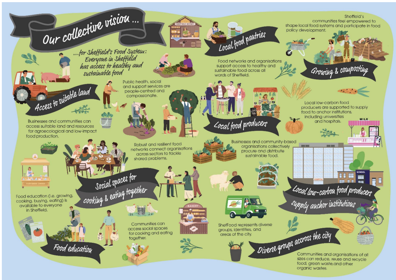
Fig. 2 ShefFood’s collective vision.

working groups focusing on: food, health, and obesity; food ladders (community food provision); good food economy and procurement; growing and composting; and good food movement (building community and increasing engagement with food activism). ShefFood’s values are also apparent in a diagrammatic representation of their collective vision (Fig. 2).