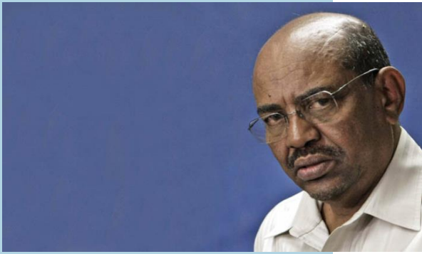
Al Bashir

the Rome Statute ( ICC-02/05-01/09-309 ) but granted Jordan leave to appeal the decision ( ICC-02/05-01/09-319 ). In the appeal, Jordan argued that President Al-Bashir enjoyed immunities ratione personae from arrest and surrender as the head of another state ( ICC-02/05-01/09-326 ).