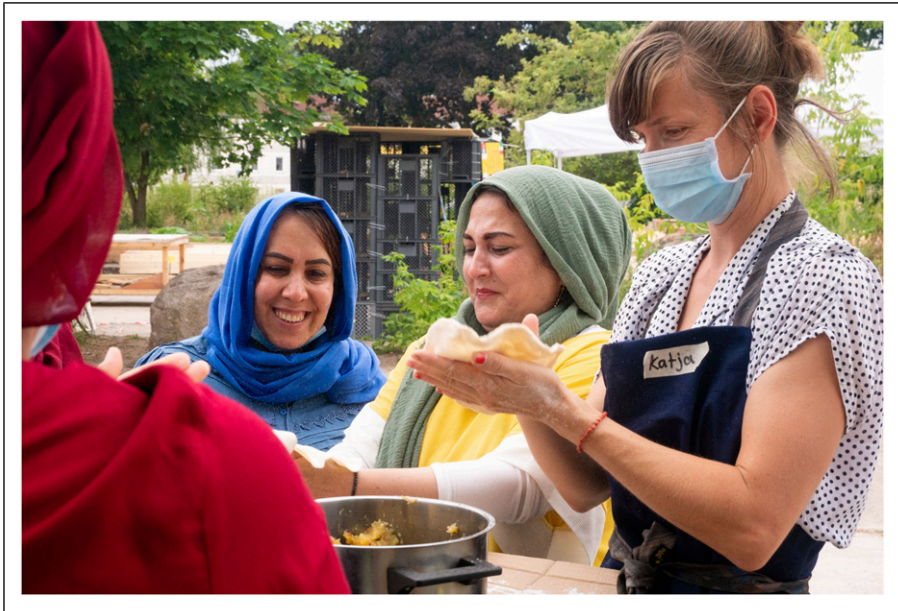
Figure 3. Collaborative cooking in Marzahn.

financial situation, housing conditions and access to work all play a role in determining the prospects of those who live there. It is a place that feels on the edge of the city and far from its dynamics.