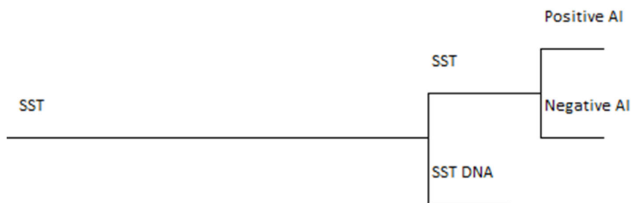
Figure 1: Decision tree for the current strategy

A decision tree describes a series of events by 'chance nodes' which are assigned probabilities for each eventuality associated with each event. The decision tree for the current diagnostic strategy is shown in Figure 1. In this, patients are referred for a SST, which they may or may not attend, then if they attend they are tested and are diagnosed as AI positive or AI negative.