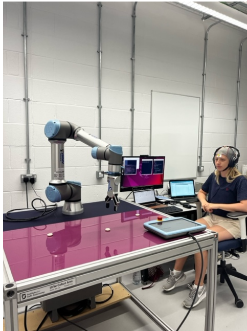
Fig. 1. Photograph of a participant during the experiment.

Once the classifier was trained, the main experiment was carried out with 4 people (including some from the pilot study). During this experiment, participants attended to either their left or right ear whilst the dry electrode EEG system collected their neural responses. These were decoded in real time using the trained SVM classifier to generate a binary response instructing the robot to either move left or right (see Fig. 1). Thus as neural signals were received, the UR-5 robotic arm would move either left or right in real-time – depending on the neural responses the classifier received. See Fig. 2 for a schematic illustrating the setup of the main experiment.