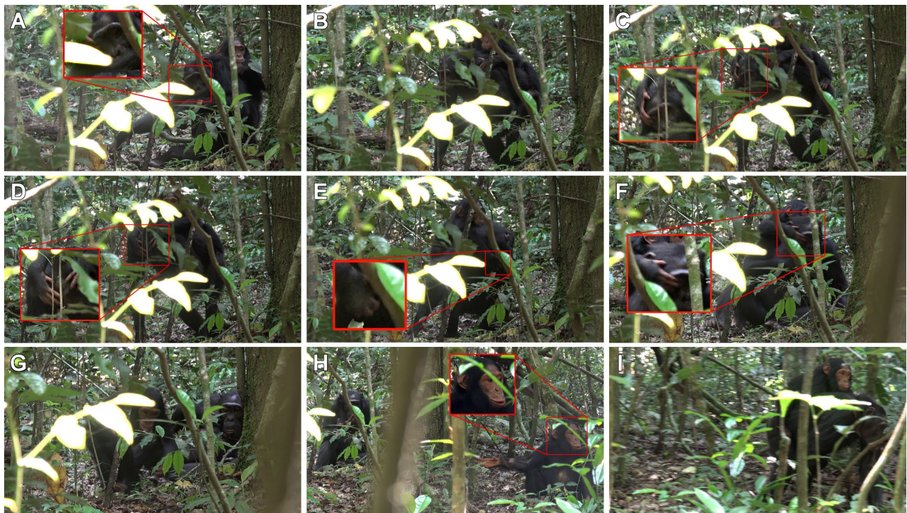
Fig. 2 Screenshots of key moments from exemplar sequence of use of ‘hand-on-eye’ during a joint-travel initiation between Lindsay and Beryl. Complete description found in Results, and the full video clip is included in the Supplemental Materials. A – C : Two instances of ‘hand-on-eye’ in rapid succession from Lindsay as Beryl gets up after resting. D : Beryl turns head away from Lindsay’s right hand. Lindsay persists with minor elaboration by reaching both hands to cover both of Beryl’s eyes. E : Beryl turns further away from Lindsay’s hands.

Lindsay persists yet again with a very extended reach to cover Beryl’s right eye. F : Lindsay reaching to cover Beryl’s right eye upon re-approaching after walking away briefly from Beryl. G : Lindsay walks away from Beryl again, with a POUT FACE, while emitting quiet WHIMPER vocalizations. H : Lindsay EXTENDS HAND towards Beryl, while WHIMPERING with a POUT FACE from ~5 m away. I : Lindsay mounted dorsally on Beryl after joint-travel begins