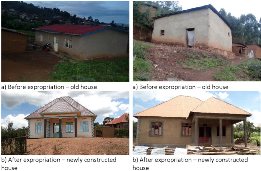
Fig. 4 Old and new houses of expropriated households.

the city. This is a clear opportunity for social mobility and underscores the need to review the current compensation package to be more comprehensive.