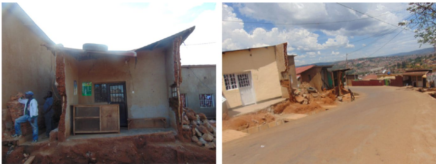
Fig. 3 Partially expropriated houses in Kigali.

Given the challenges that people are going through to reconstitute their assets, the study further investigated livelihood coping strategies. Three major activities emerged from the interviews: urban agriculture, small-scale non-farm businesses and migration. In a bid to survive in their new environment, many households have resorted to growing crops and vegetables and rearing livestock (e.g., pigs, goats, and poultry) to make a living. Although this was a departure from their original livelihood activities in Kigali, the new environment was a perfect fit for such activities.