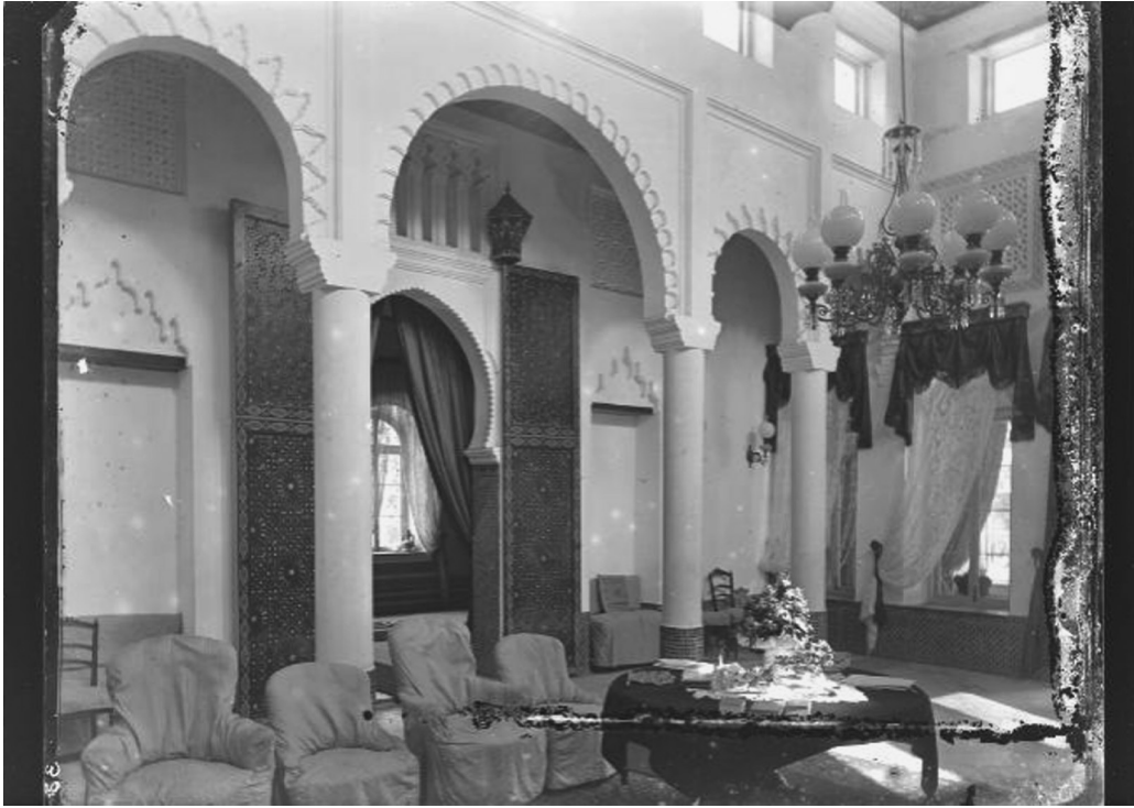
3. Interior of the German Legation, c.1880.