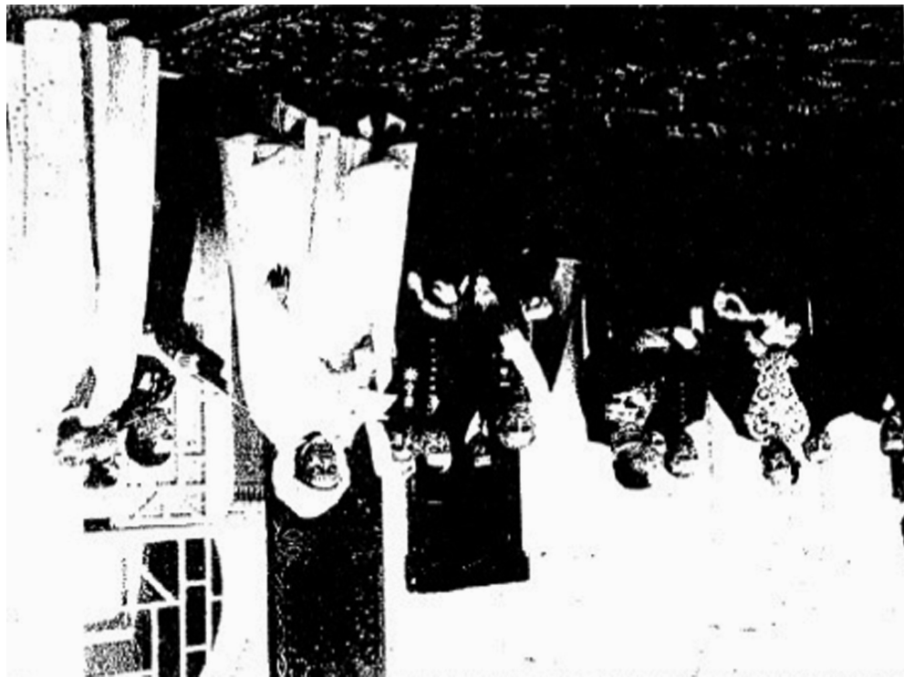
6. The mendoub inaugurating the Tangier Statue, 'Le Statut de Tangier', L'Afrique du Nord Illustrée , 13 June 1925, 3.