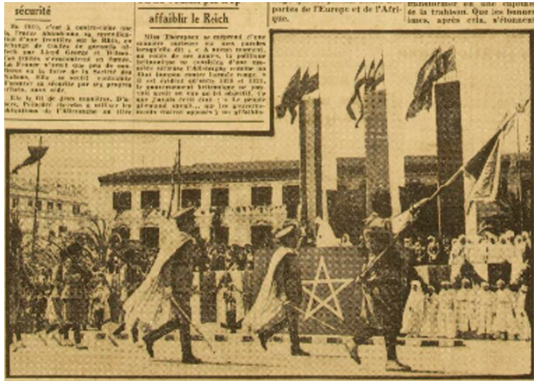
7. Bitter commentary among French newspapers on the German and Spanish parades of 17 March 1941, in which the Mendoubia was returned to the Germans, is exemplified by the publication of this photograph in France-Soir , 17 Aug. 1945, 1.