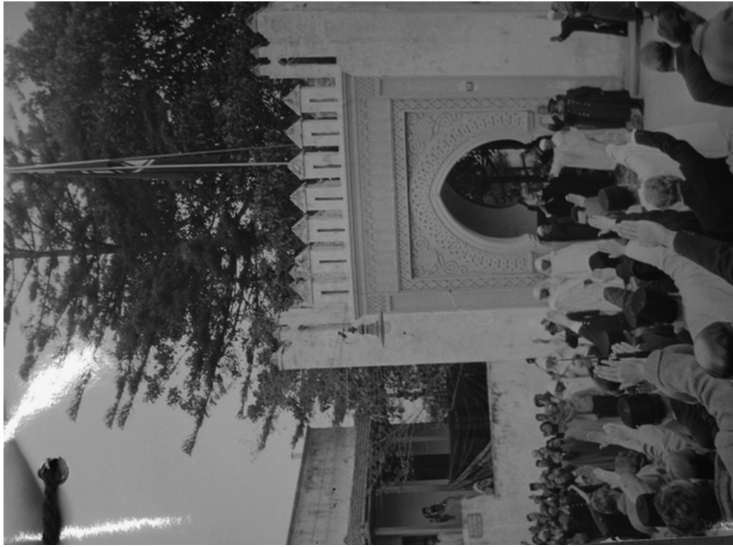
2. The return of the Mendoubia, 17 March 1941. The National Archives, London, FO 371/39684.