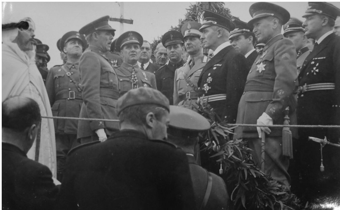
1. Spanish authorities returning the Mendoubia to representatives of the German Foreign Office, 17 March 1941.