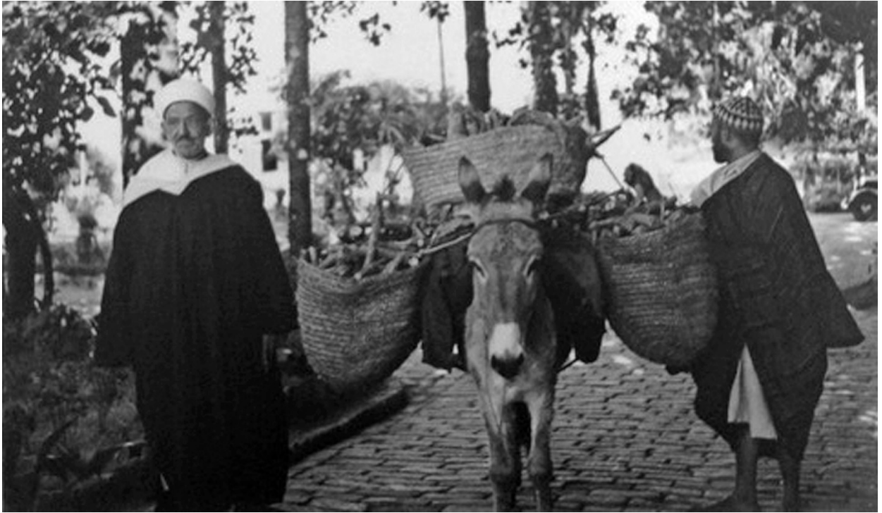
8. The replanting of the German Legation's gardens as captured by the German official Adolf Gustav Sonnenhol. Politisches Archiv des Auswärtigen Amts, Berlin, NL Sonnenhol 297/54.