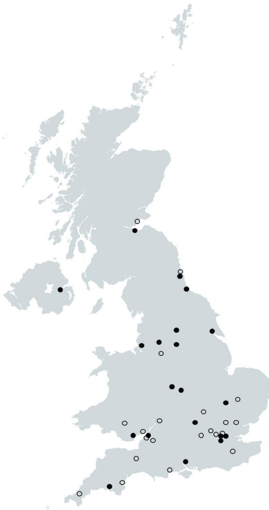
Figure 2 Distribution of participating organisations in the UK. Closed circles indicate major trauma centres and open circles indicate trauma units.