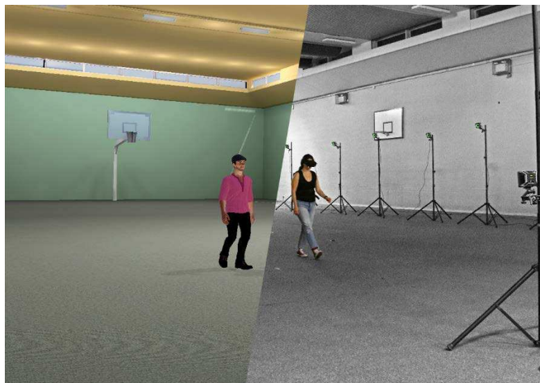
Figure 1: A person wearing HMD (right) walking next to the pacer in the virtual environment (left).

Only the data from the sensor strapped to the ankle were used, as the data were sufficient to describe a gait cycle fully.