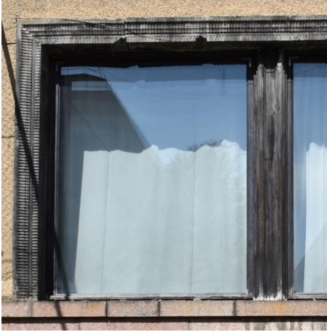
Fig 2: Detail of Central Post Office 1930-1932