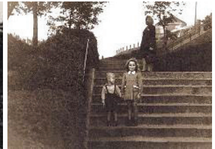
Fig. 6. Kauko city stairs [28];