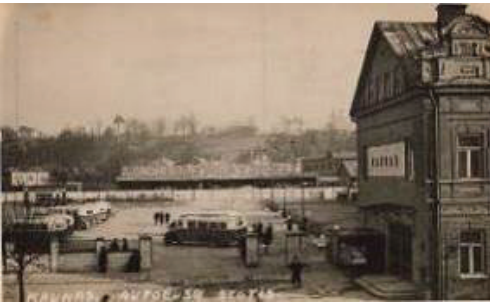
Fig. 4. New modern public transport and other transport facilities: Kaunas bus station in 1937 [26];