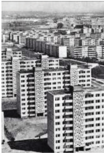
Fig. 17. Large scale modernist residential development [34].