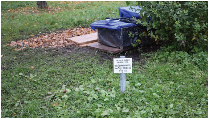
Fig. 31. Changing modernist neighborhoods in Kaunas: illegal cat feeding areas.