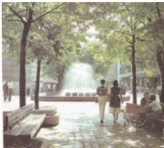
Fig. 10. Users of different age groups in public spaces of Kaunas in the Soviet period: Kumelių Street.