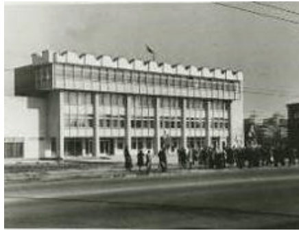
Fig. 22. Modernist urban fabric.