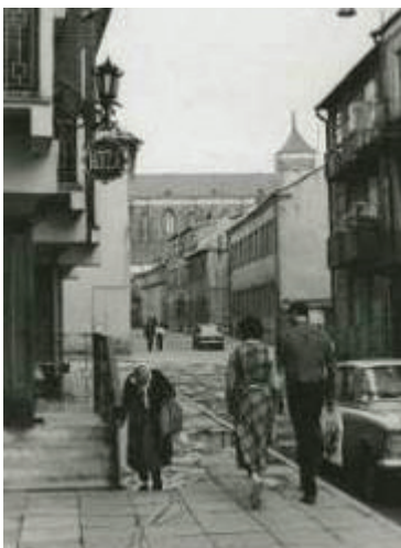
Fig. 10. Users of different age groups in public spaces of Kaunas in the Soviet period: Kumelių Street. Photographs from the collection of Aleksandras Pleskačias [32].