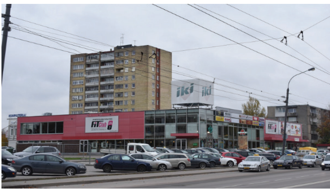
Fig. 33. Increasing accumulation of individual automobiles and visual advertisement in public spaces.