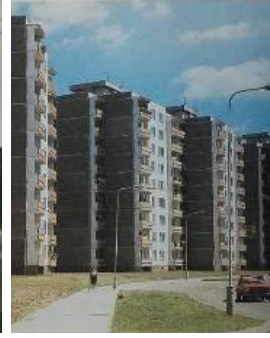
Fig. 23. Attention to the automobile in the modernist districts of Kaunas: clearly separated zones for cars and pedestrians [33].