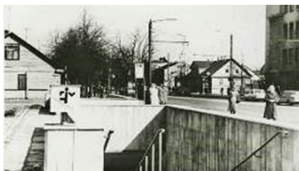
Fig. 26. Modernized urban fabric [Photographs from the private collection of Aleksandras Pleskačiauskas].