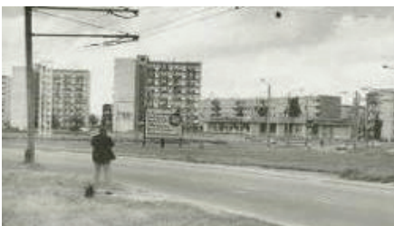
Fig. 25. Low level of social space control in modernist.