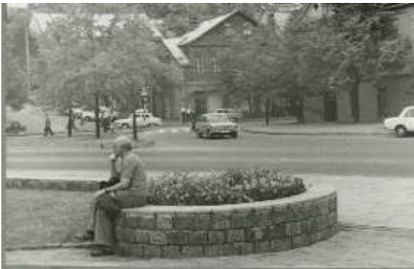
Fig. 12. Optional recreational activities in Kaunas city: Steigiamojo Seimo Square.