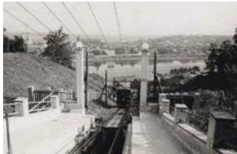
Fig. 5. Aleksotas cable car in 1937 [27];