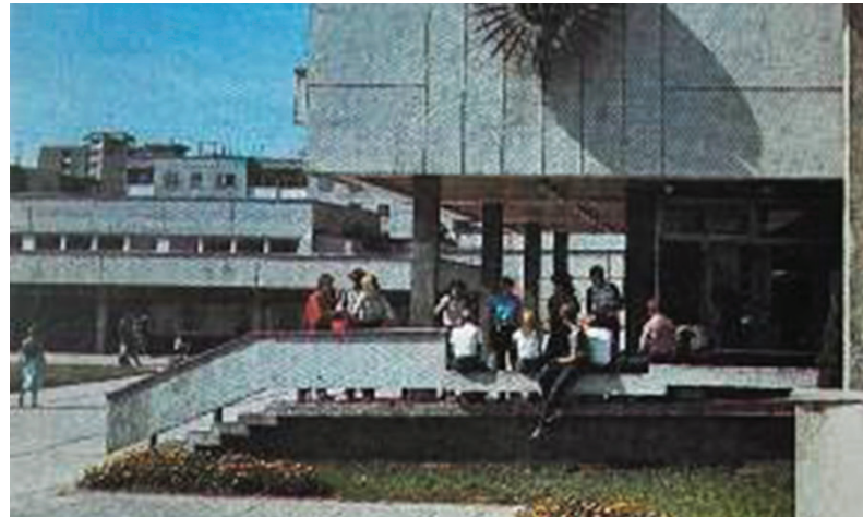
Fig. 15. Spaces in front of public buildings [33].

attraction of the area, with the most frequent gathering of users. Another phenomenon observed in the images of this period — informal gatherings of people at the entrances to the public and multi-apartment residential buildings, which became a kind of informal public spaces (Figs. 14, 15). This phenomenon illustrates the social need for “space as a meeting place”, which corresponds to the personal and social space scale.