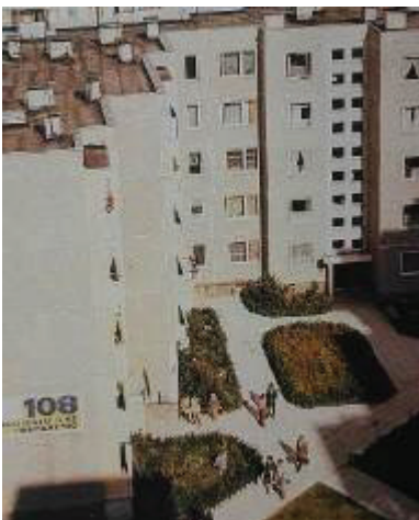
Fig. 14. New meeting points in the modernist districts of Kaunas city in 1980: entrances of multi-apartment residential buildings [24];