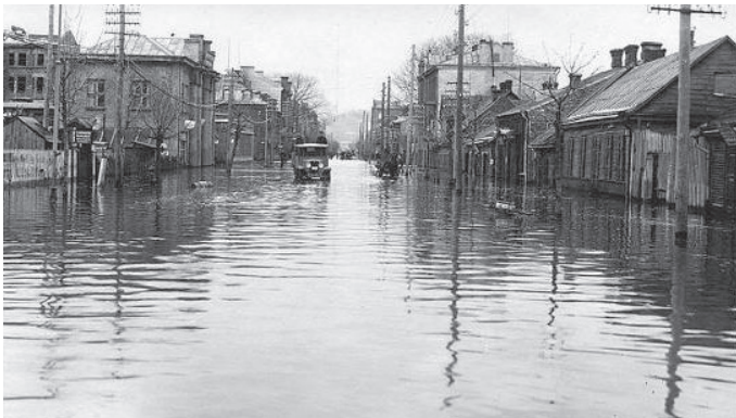
Fig. 8. Extreme situations in the center of Kaunas of the interwar period: Nemunas floods in the center of the city, photo by Veronika Šleivyte, KEM GEK 16111, Kupiškis Ethnographic Museum [30];