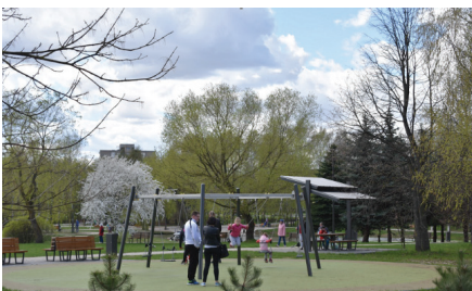
Fig. 28. Examples of optional or recreational activities in contemporary Kaunas.