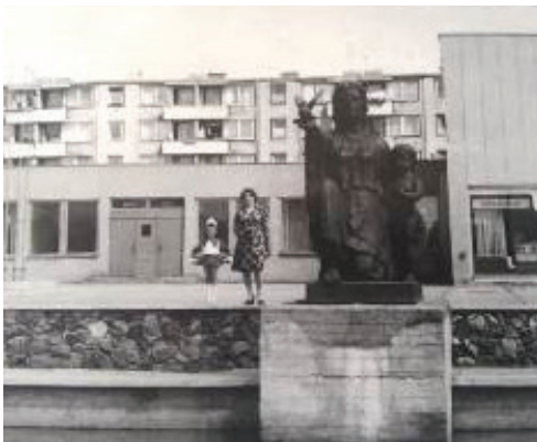
Fig. 19. Large scale monuments in public space: modernist district center “Girstutis”.