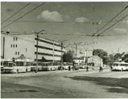
Fig. 21. New public nodes with transit character in Old Town.