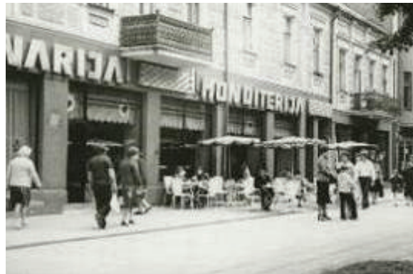
Fig. 13. Street cafes in Laisves Avenue.