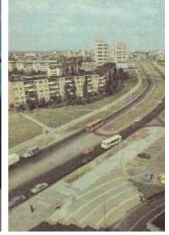
Fig. 24. Automobile infrastructure [33].