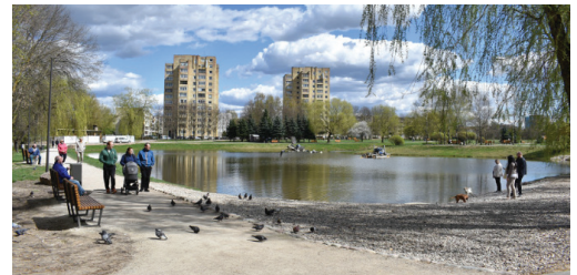
Fig. 27. Examples of optional or recreational activities in contemporary Kaunas [Photo: Authors of the Article].