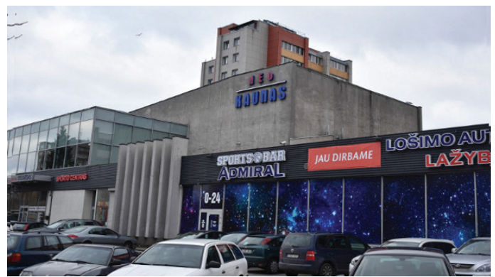
Fig. 34. Increasing accumulation of individual automobiles and visual advertisement in public spaces [Photo: Authors of the Article].

is compensated by the attempts of the residents themselves to embellish their living environment and by the emerging street art culture in Kaunas, both legal and illegal, well reflected in the media images (Figs. 29, 30). The new feature in the public spaces of modernistic neighborhoods appearing as a result of optional activities are both designated and illegal homeless cat feeding areas (Figs. 31, 32).