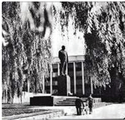
Fig. 20. Vienybės Square in the city center [34].

Mobility. The analyzed images demonstrate the increasing importance of public transport both in modernized and modernist urban areas. Due to the rarely used private vehicles (quite few of them are seen on the streets in the analyzed images) and very popular public transport, which was very important for communication in a territorially expanding city, the analyzed photos show a significant accumulation of users at public transport stops. The availability of public transport networks had influenced both the users and activities and development of public spaces. People waiting for public transport can be seen in the images both in the modernized and modernist neighborhoods (Figs. 21, 22). Development of public transport and mobility network of the Soviet period had created new public nodes with transit character visible in the analyzed photographs, these nodes had not existed before and some of them disappeared afterwards.