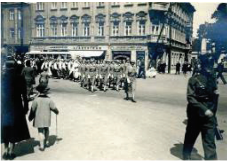
Fig. 1. The users and activities in public spaces in inter-war era: festive procession in the central streets of Kaunas in 1937 [22].