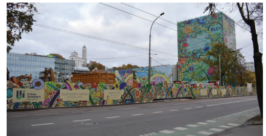
Fig. 30. Spontaneous attempts to embellish urban environment: business supported initiatives.

barriers in the images of the Soviet era provide an image of accessibility and safety (Figs. 25, 26). It is interesting that in the Soviet-era photographs the presence of uniformed officers in public spaces is higher. They appear much more often in the analyzed photographs of the Soviet era than in other periods.