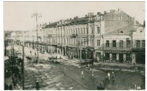
Fig. 3. Typical street space of the inter-war Kaunas: Laisves Avenue around 1935 [24].