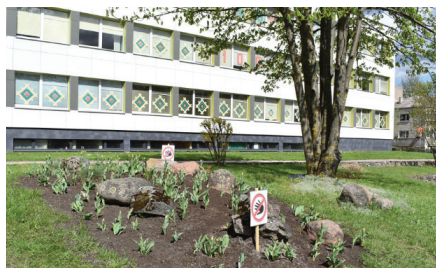
Fig. 29. Spontaneous attempts to embellish urban environment: individual.