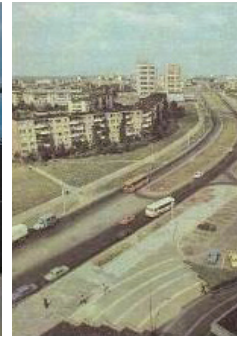
Fig. 24. Automobile infrastructure [33].