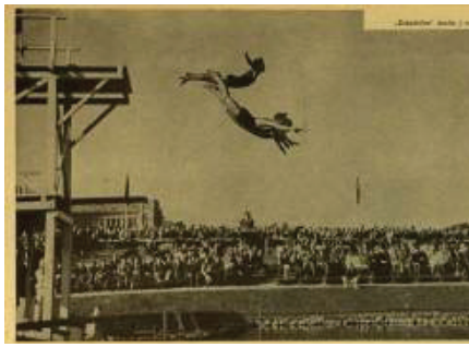
Fig. 2. A view from the yacht club water sports event on Nemunas island in 1938 [23].