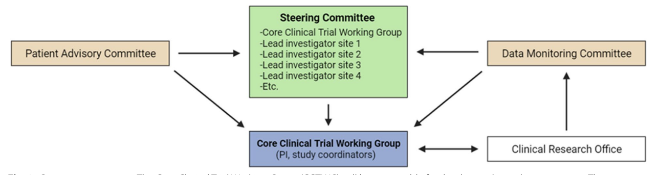
Fig. 3 Governance structure. The Core Clinical Trial Working Group (CCTWG) will be responsible for the day-to-day trial management. The steering committee (SC) consists of the CCTWG and the principal investigators of each participating site and is tasked with major decisions regarding the study progress and design. The Data Monitoring Committee (DMC) is responsible for the safety of participants and advises the SC based on the interim analysis. A Patient Advisory Committee has been appointed to advise the SC regarding any patient-related matters. The Clinical Research Office is responsible for, among others, monitoring the trial and for providing safety data that can be assessed by the DMC and be sent to the competent authorities

to baseline eGFR and salt and protein intake, since disease progression is associated with urinary concentrating defects [32, 33] and salt intake [34], and because urinary volume is largely driven by osmolar excretion when renal water reabsorption is impaired [11].