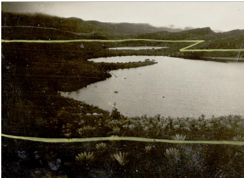
Figure 2. Picture of the Chisacá Lake surrounded by frailejones and depicting a person on horseback.

Picture probably by C. R. Marthaler or Wills, 1928 (EAAB, Caja 42, Tomo 2 , f. 61). Permission obtained from the Bogotá Archive.