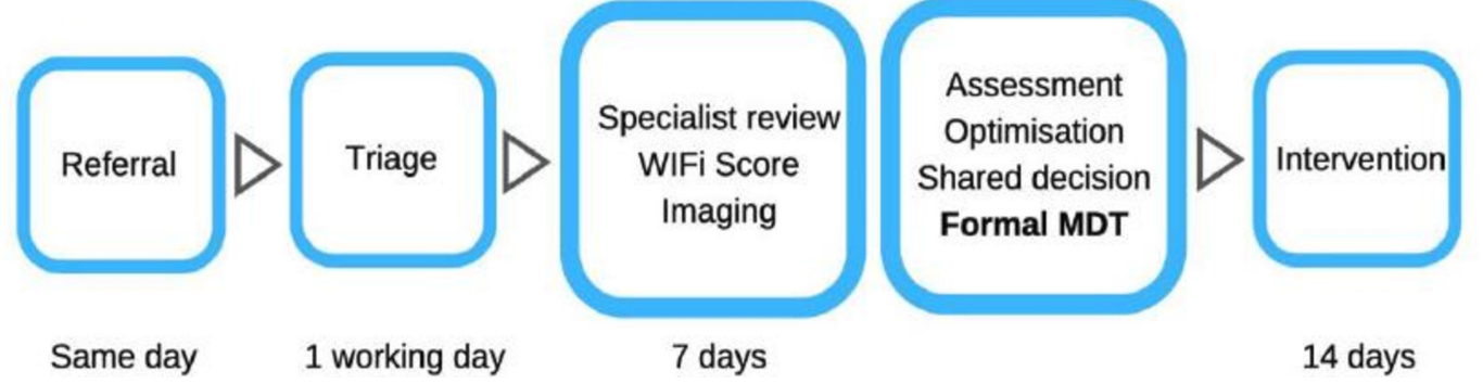
Figure 2 PAD-QIF targets for time-to-revascularisation pathways. <sup>14</sup> Reproduced with permission of the Journal of Vascular Societies of Great Britain and Ireland . PAD-QIF, Peripheral Arterial Disease Quality Improvement Framework. MDT, multidisciplinary team

Non-admitted patient - stable disease, such as mummified toes