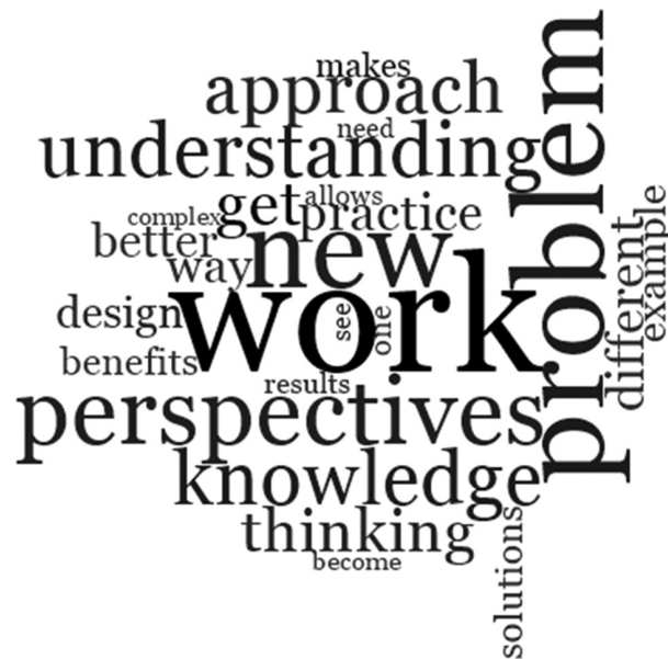
Fig. 3. What are benefits of interdisciplinarity? A word cloud of the top 25 synonymous words using authors' own descriptions of the benefits of interdisciplinarity. Larger fonts indicate greater word frequency. "Work" is the most frequent word constituting synonyms like bringing, exploit, form, processes, and make. (Word cloud created with Nvivo v. 12, QSR International Inc., Burlington, MA.)

"As a behavioural ecologist by training, I would have little success interpreting patterns of population size in some Arctic seabirds if I did not have some appreciation for oceanography and climate research, but I would also miss much if I didn't understand international politics as they relate to wildlife management, or if I failed to look into oral history of aboriginal peoples to assess long-term cyclical patterns in wildlife abundance."