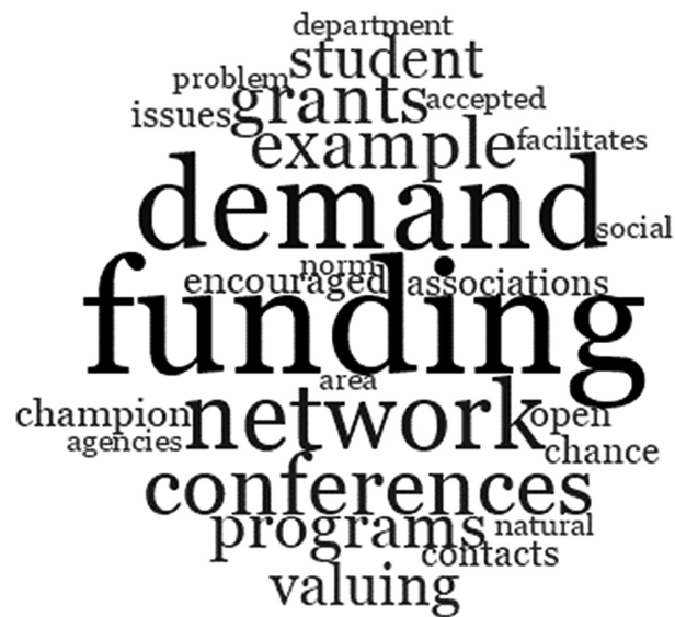
Fig. 6. What are facilitators to interdisciplinary research and scholarship? A word cloud of 25 stem words from coded text of authors' discussion on facilitators to interdisciplinary research and scholarship. Larger words illustrate greater frequency. Unlike the meaning of the word "funding" in Fig. 5, here it refers to funding agencies and programs as being key to facilitating and promoting interdisciplinary work. (Word cloud created with Nvivo v. 12, QSR International Inc., Burlington, MA.)

However, it can often be a challenge to find such conferences and spaces that are inherently interdisciplinary in scope. A good model for enabling such workshops are the "synthesis centers" in the United States that bring together diverse scholars to tackle interdisciplinary problems (see Baron et al. 2017).