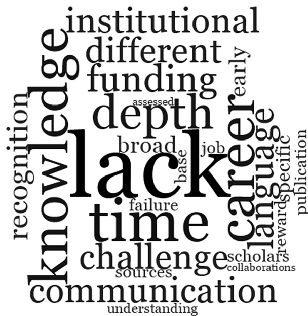
Fig. 4. What are the risks and drawbacks to engaging in interdisciplinarity? A word cloud of the top 25 synonymous words using the thematized coded text from authors' written discussions on the risks and drawbacks to engaging in interdisciplinarity. Larger fonts indicate greater word frequency. Note that the word "lack" was associated with some of the other words (e.g., lack of knowledge, recognition, time, depth, funding, etc.). (Word cloud created with Nvivo v. 12, QSR International Inc., Burlington, MA.)

The central risk of widening our horizons as researchers is that we skim the surface rather than delving deeply into the subject at hand ( Box 1 ). We must guard against superficiality. Just because one reads Clifford Geertz does not make one an anthropologist or even particularly knowledgeable about the debates and knowledge produced by that discipline. A number of interdisciplinary-friendly scholars have therefore warned of the danger of being disembedded altogether from disciplinary ways of knowing. Each of the authors of this article has a scholarly home-place, somewhere where we were trained, with whom we identify, teach, even belong. As interdisciplinary scholars, we also operate between, across, and through other disciplinary home-places, but our intellectual travels and interdisciplinary practices are not boundless.