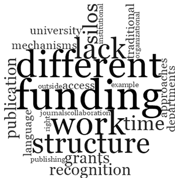
Fig. 5. What are challenges and barriers to engaging in interdisciplinarity? The top 25 synonymous words using the thematized coded text of authors' discussions on the challenges and barriers to engaging in interdisciplinarity. Larger fonts indicate greater word frequency. The most frequent words “funding” refers to barriers in funding mechanisms and “different” was often associated with challenges with different fields, norms, departments, work, etc. The word “work” also describes processes, and “structure” was often associated with challenges in funding, institutional, and organizational structures. (Word cloud created with Nvivo v. 12, QSR International Inc., Burlington, MA.)

Barriers and challenges to engage in interdisciplinarity have been discussed in prior literature but often come from the perspective of a discipline or field of study (e.g., Fox et al. 2006). Here, we list the challenges and barriers that were experienced from a range of disciplinary perspectives by College members and depict the most frequent words used by authors to describe the challenges in a word cloud (Fig. 5).