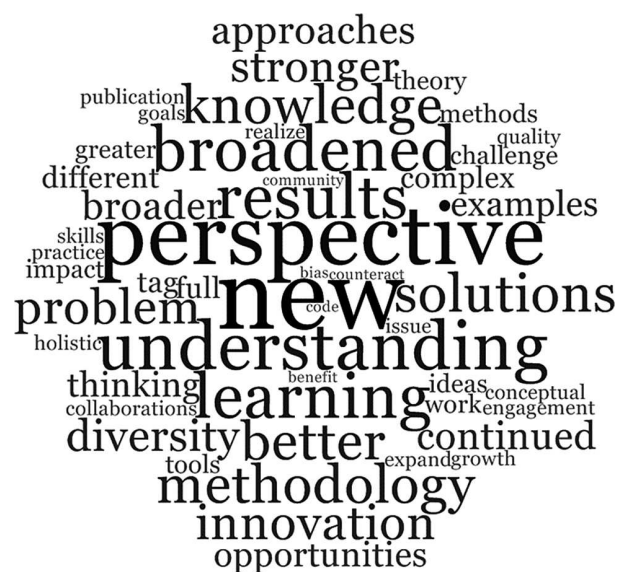
Fig. 2. What does interdisciplinarity mean? A word cloud of the top 50 words from text written by the authors describing what interdisciplinarity means to them. Larger words illustrate greater frequency counts. (Word cloud created with Nvivo v. 12, QSR International Inc., Burlington, MA.)

“I consider it a mostly meaningless academic buzzword. I do use it, however, but largely in grant applications and similar genres of writing in which I try to give institutions the kinds of text that I presume they are looking for.”