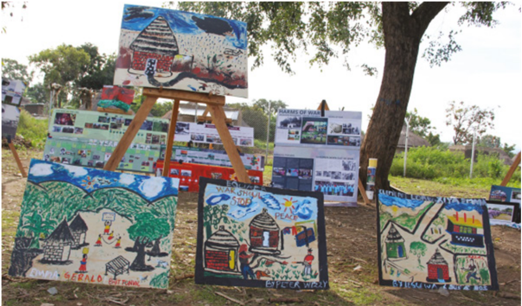
Figure 3. The touring exhibition on display.