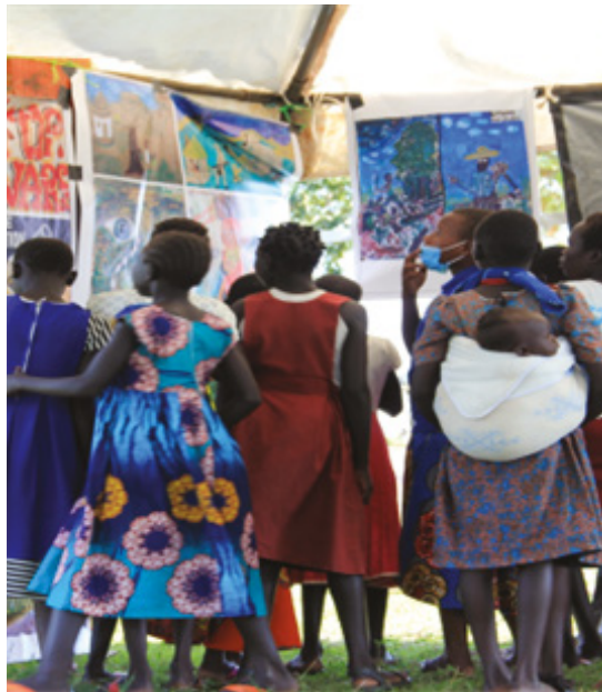
Figure 1. Young people engaging with art.

The touring exhibition featured artworks, poems and stories but was also a site where dancing, singing and conversations could take place. Seeing what others had contributed offered a way of thinking about the ideas they represented, and different