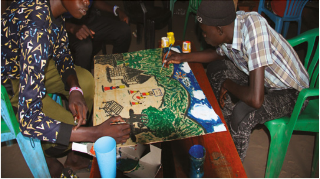
Figure 2. Creating the exhibition.